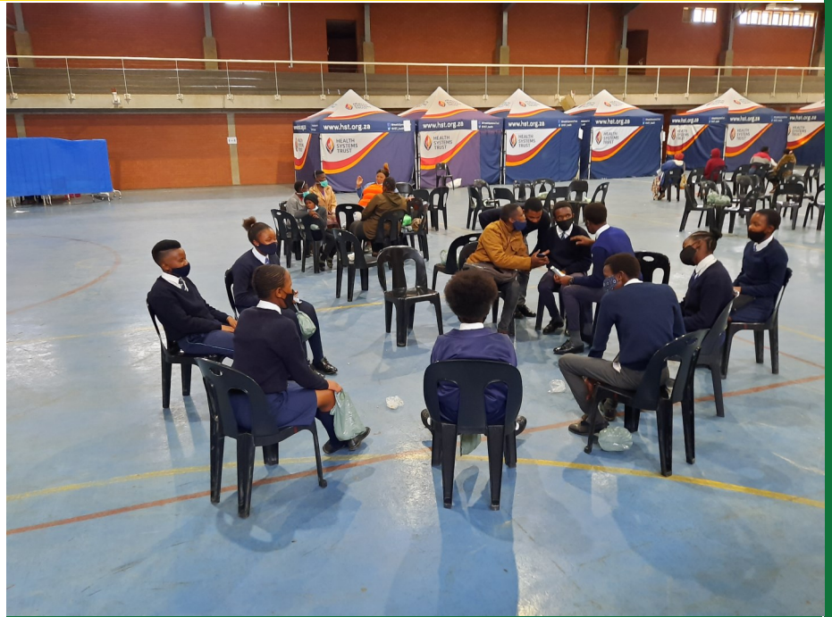
Youth health services was another priority at the event. Scholars, especially young and teenage females from nearby schools were allowed to access health services which were related to youth health.

- Violence against women: Women can be subject to a range of different forms of violence. Physical and sexual violence, either by a partner or someone else is faced by women daily. Men and other stakeholders are encouraged to protect women. Women are encouraged to report the abuse as soon as possible and to leave abusive relationships.