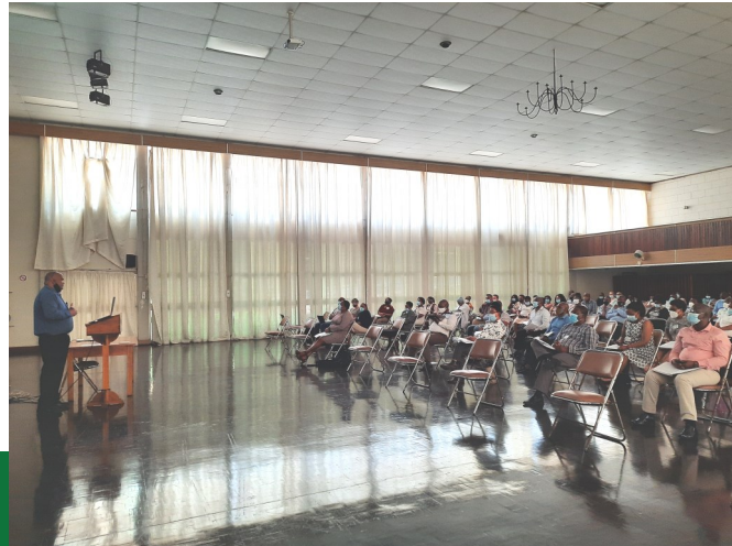
Above: Mr M Green, DD Monitoring & Evaluation for the district addressing the attendants.

U Mgungundlovu Health District held a District Health Strategic Planning session for three days, starting on 17 November 2020 up to the 19th of November 2020. The planning session's priority was to re-focus and re-prioritise the goals of the district. The main aim was to gather information, strategically discuss and plan the future of the whole district when it comes to health-related matters.