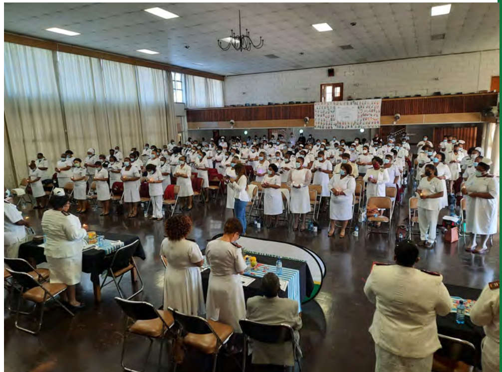
Nurses from uMgungundlovu District gathered at Greys Hospital to commemorate the International Nurses Day

The theme for this year's Nurses' Day as per World Health Organisation is "Nurses: A Voice to Lead - Invest in Nursing and Respect Rights to Secure Global Health". uMgungundlovu District celebrated this honourable day on 24 May 2022 where a large number of nurses of all categories and levels gathered at Grey's Tertiary Hospital in Pietermaritzburg to be saluted and reminded that they are the voices for their patients and the community.