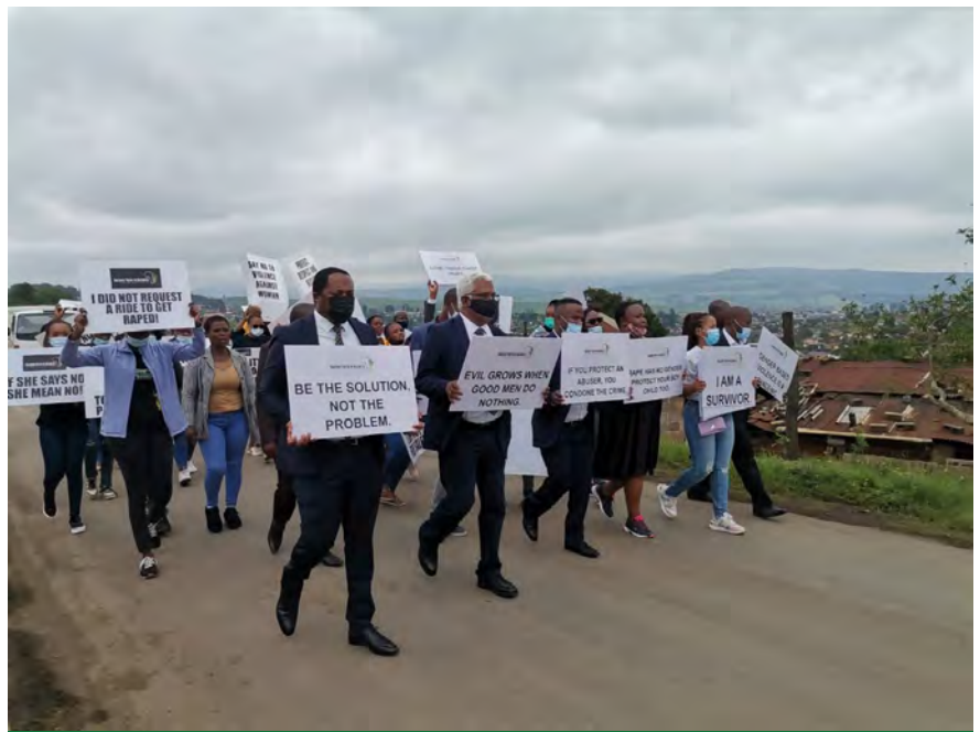
The world AIDS day commemoration in Richmond, Magoda area started with a peaceful March against Gender Based Violence where women were encouraged to speak out against being violated

The prevalence of the AIDS pandemic in South Africa is very high and KZN is amongst the provinces with the highest numbers of infected individuals in the country. There is still however more work left to be done to reduce the prevalence of the virus by the Department of Health, other Public Service departments, NGOs, Community Leaders and the community in the general.