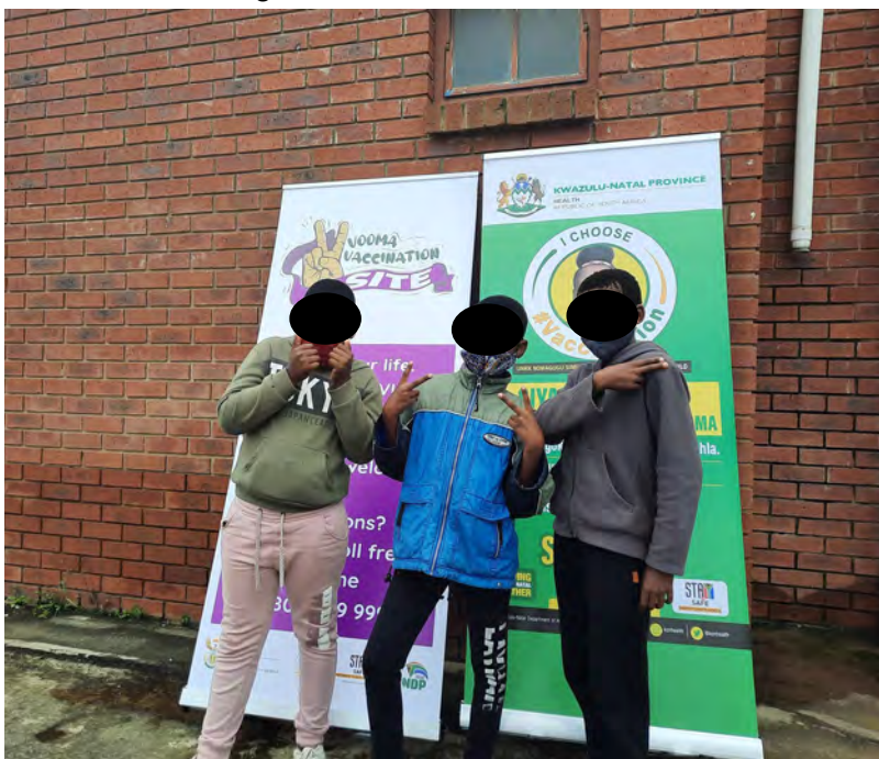
Happy after their received their dose of the Pfizer vaccine, 12 and 13 year old boys from the Dambuza area in Pietermaritzburg

The province and the district is implementing strategies with external stakeholders to increase the uptake of vaccines. Some areas need more focus than others. More community education and follow-ups need to happen