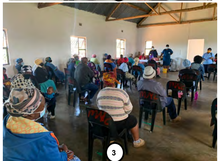
PIC 1: The Zwakala initiative offered one-on-one education, grocery vouchers, worked with locals to increase demand.