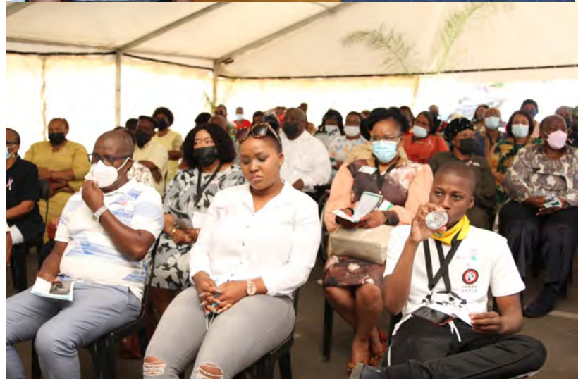
Pic 1: MEC Simelane unveiled a portrait of the Late Harry Gwala that she personally bought as a gift to the hospital.