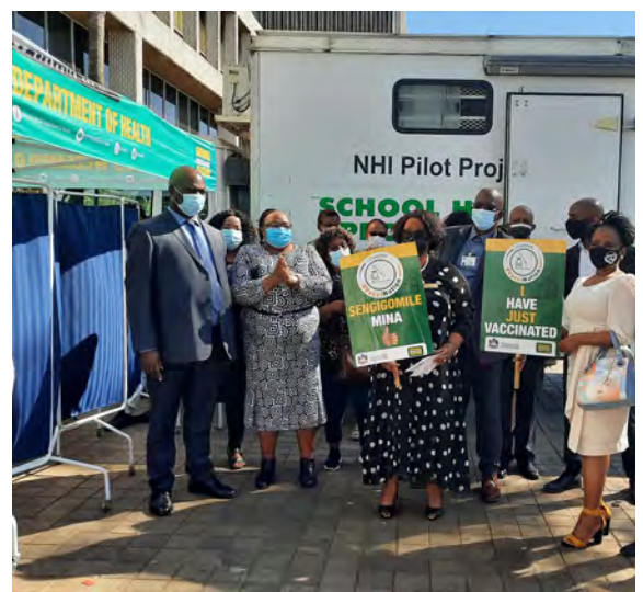
The Covid-19 vaccination Pop-up site at Natalia Building was initially aimed to vaccinate employees but ended up being amongst the most popular and most utilised by the public