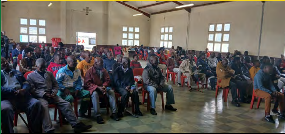
Men attending the Isibaya Samadoda event in iNcwadi area

uMgungundlovu District continues to ensure that men's health programmes are prioritised for the community, especially in rural areas. On 4 December 2024, Isibaya Samadoda event was held in the Caluza area. This is an event targeting males only. The event aimed to promote the well-being of men and lessen the health burdens they face daily. These burdens often contribute to detrimental social ills such as