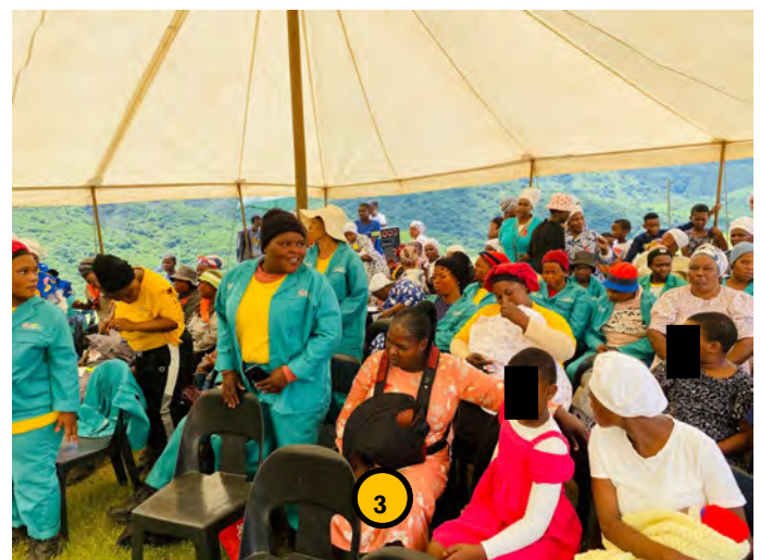
Photo 1: Impilwenhle Clinic staff and guests during their event; Photo 2: Willowfontein Clinic's community came in numbers to attend the event; Photo 3: Attendees from Embo Clinic, a clinic in a deep rural area came from local communities and Farms