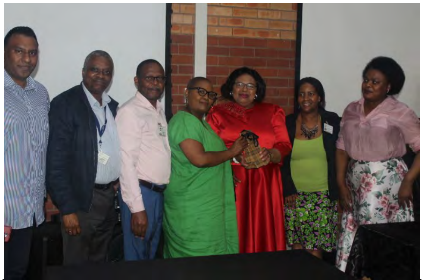
The facility CEOs came to say farewell to their supervisor

Diploma in General Nursing obtained in the year 1988. until a PhD in Public Management at the Durban University of Technology (DUT) in 2016. She also held multiple management positions at different health facilities including being a CEO at Ceza and