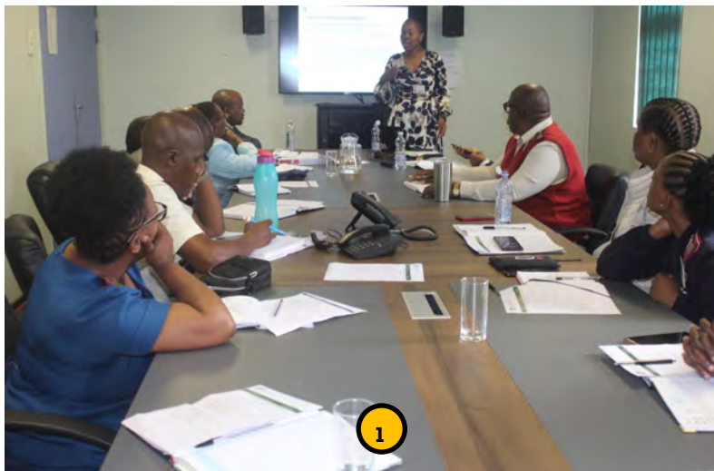
Photo 1: Ms Hadebe addressing the hospital's management team on the Popi Act

The district office plans to have these sessions throughout the District during March 2025 at different facilities. On 21 March, South Africa celebrates Human Rights Day. A day where the rights of individuals are commemorated in the country due to the Sharpeville Massacre of 1960 where 69 people were shot and died due to the apartheid government's violation of human rights.