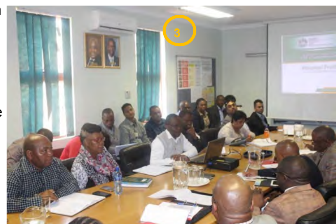
Picture 1: Committee Members interacting with Health Care Users at Mpophomeni Clinic