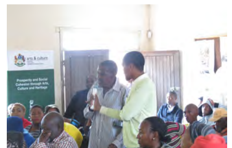
OSS Community engagements with the KZN Cabinet READ MORE ON PAGE 5

FIGHTING DISEASE, FIGHTING POVERTY, GIVING HOPE