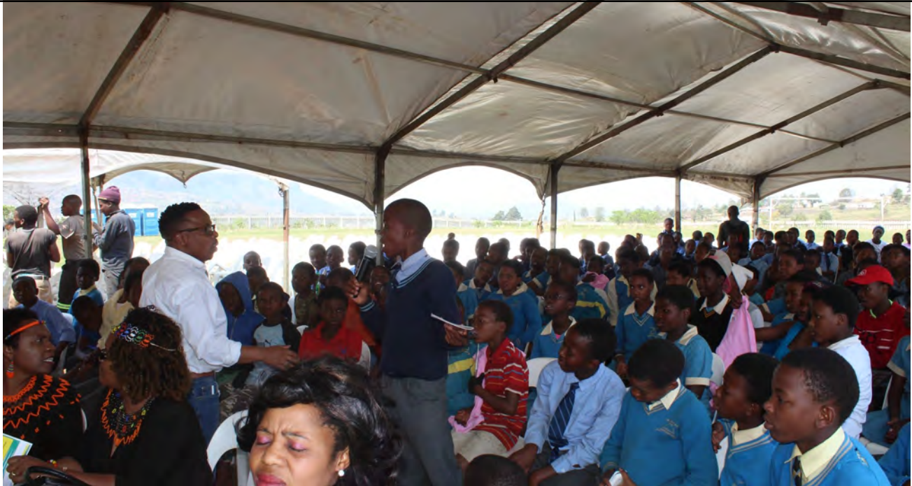
At the Marquee about 1500 students gathered to hear what the Adolescent and Youth Friendly Services had in store for them, pictured is one of the students making his views heard during the event

On the 28th of September 2018 the office of uMgungundlovu Health District launched an Adolescent Youth Friendly Service (AYFS) held at eMahlabathini Sports field in ward 1 in Maqongqo area. The AYFS programme explores strategies to providing sustainable youth-friendly health-care services that will be easily accessible to youth, teenagers and young adults.