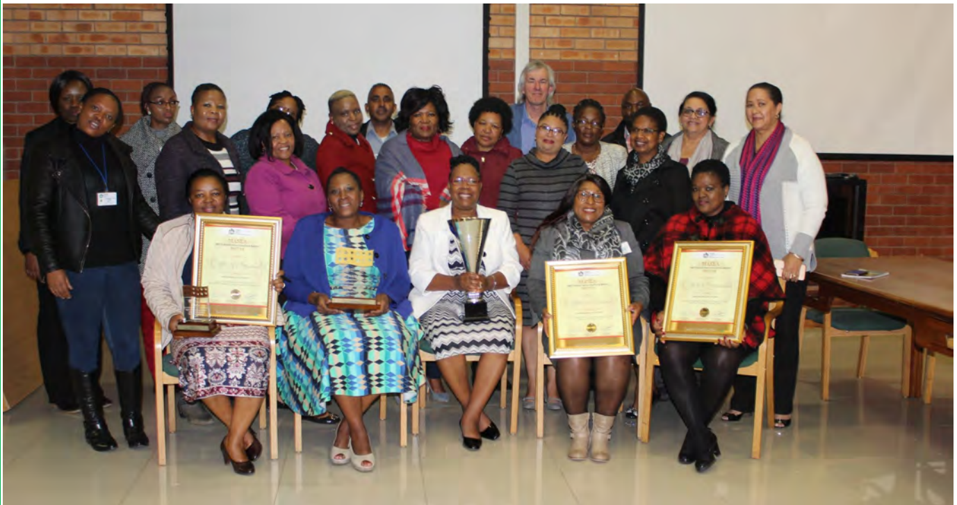
The uMgungundlovu Health District Team proudly displaying their achievements

HIV/AIDS and Tuberculosis (TB) still continues to be a problem facing the South African, Provincial and uMgungundlovu District Department of Health and communities. There is a high prevalence of people infected with HIV and a high number of people infected with TB. Even worse there are people who are suffering from Multi-drug-resistant tuberculosis (MDR-TB) and Extensively drug-resistant tuberculosis (XDR-TB) which are difficult to treat and normally develop if a person failed to complete treatment for Sensitive TB (normal TB).