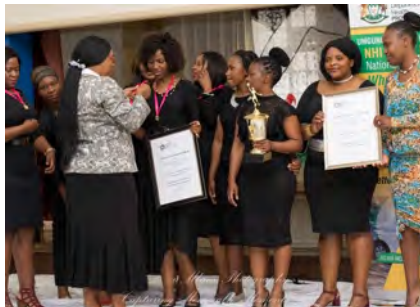
uMgungundlovu Sports and Recreation teams and individuals awarded READ MORE ON PAGE 2

In the month of August, the National Health Portfolio Committee visited health facilities in Umgungundlovu District. They liaised with facility management, staff members, hospital and clinic committee members, and health care users of these different facilities. The aim of the visit was to find out from these different stakeholders about the operations of the facility. Pictured above, the team was at Crammond Clinic looking into an alternative water source/supply to accommodate users during an emergency. Full story on page 5