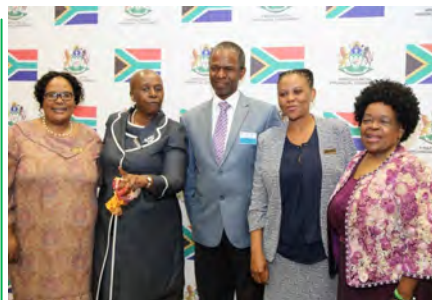
New Constitutional Values and Principles for Public Servants READ MORE ON PAGE 9