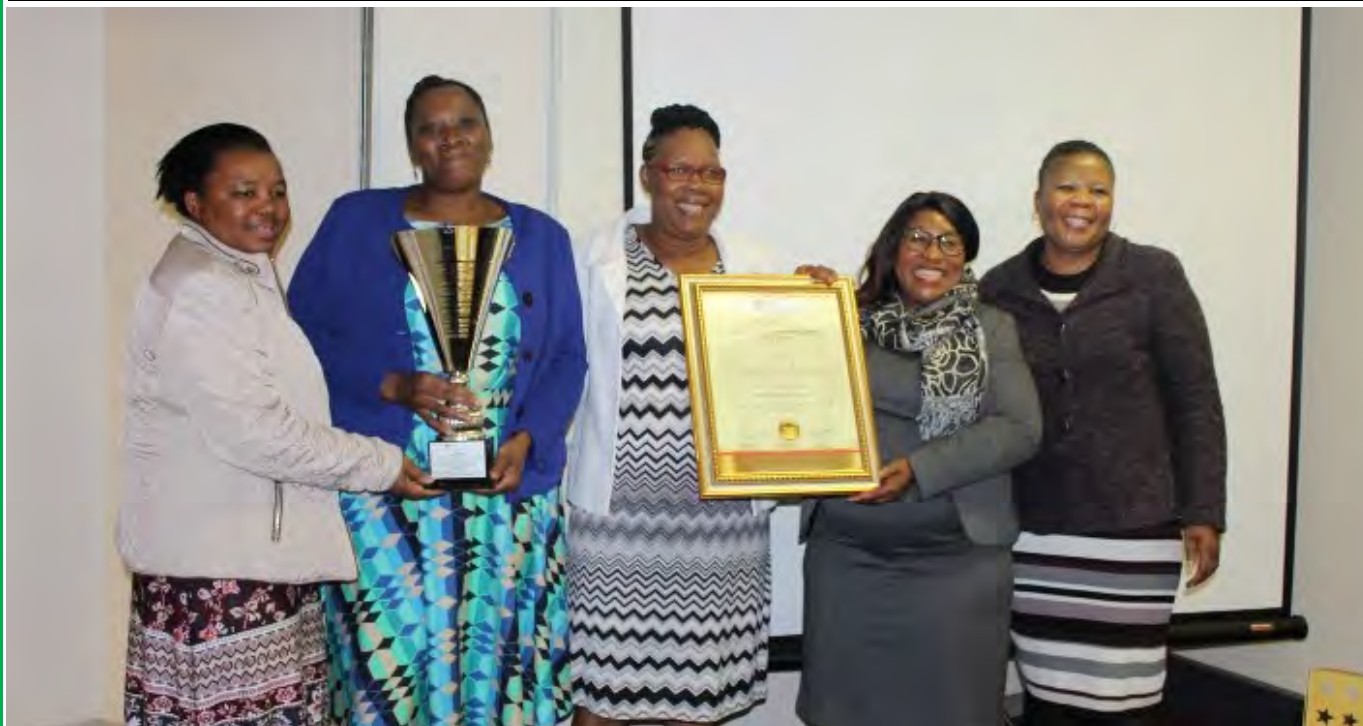
The District Team proudly displaying their achievements

The facilities were requested to centralise the screening of patients for TB, client flow was planned in such a way that all clients who visited the facility had to go via the screening point. This ensured that all clients were screened and there was no duplication. The Monitoring and Evaluation (M & E) component played a vital role in ensuring the success of this project with regular physical monitoring done by the TB and M & E Team .