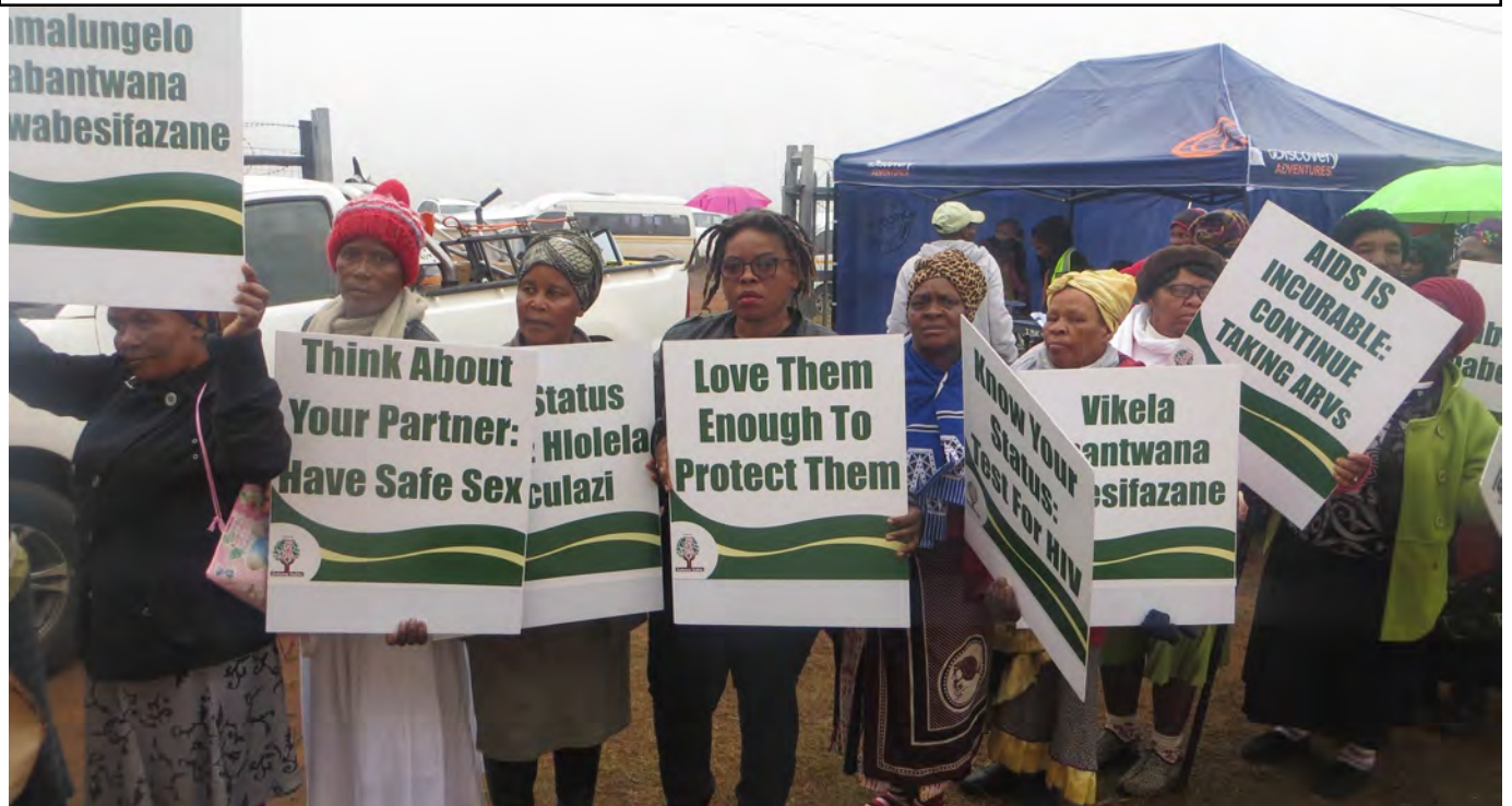
Placards with different messages were carried and displayed by community members.

The youth was encouraged to take good care of themselves and focus on their education. Pregnant women were encouraged to visit their local clinics before 20 weeks of pregnancy for ante-natal care, by doing so there won't be a high mortality rate of mothers who are pregnant and the unborn children would have been taken care of.