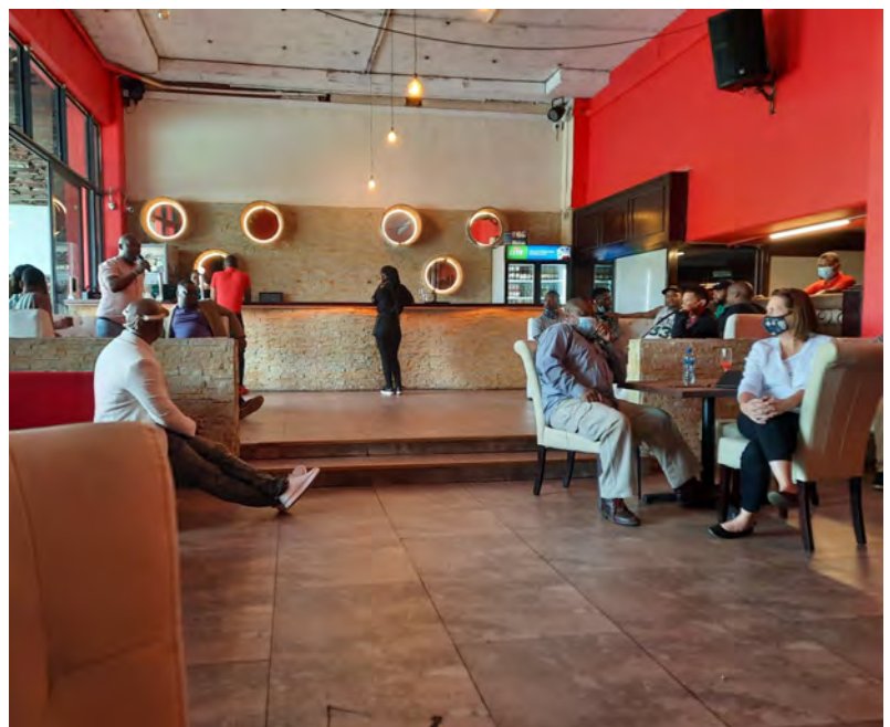
Patrons at the Ora Bar and restaurant were encouraged to get vaccinated so the industry can get back to normal