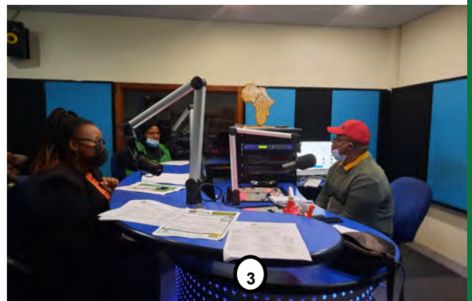
Pic. 1: An 18 year old female being interviewed at Ashdown clinic after she received her vaccination