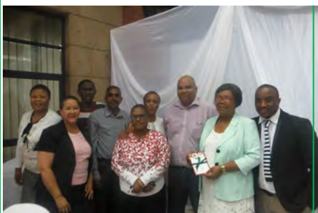
YEAR CLOSED AND OPENED WITH A GROUP PRAYER .... READ MORE ON PAGE 08