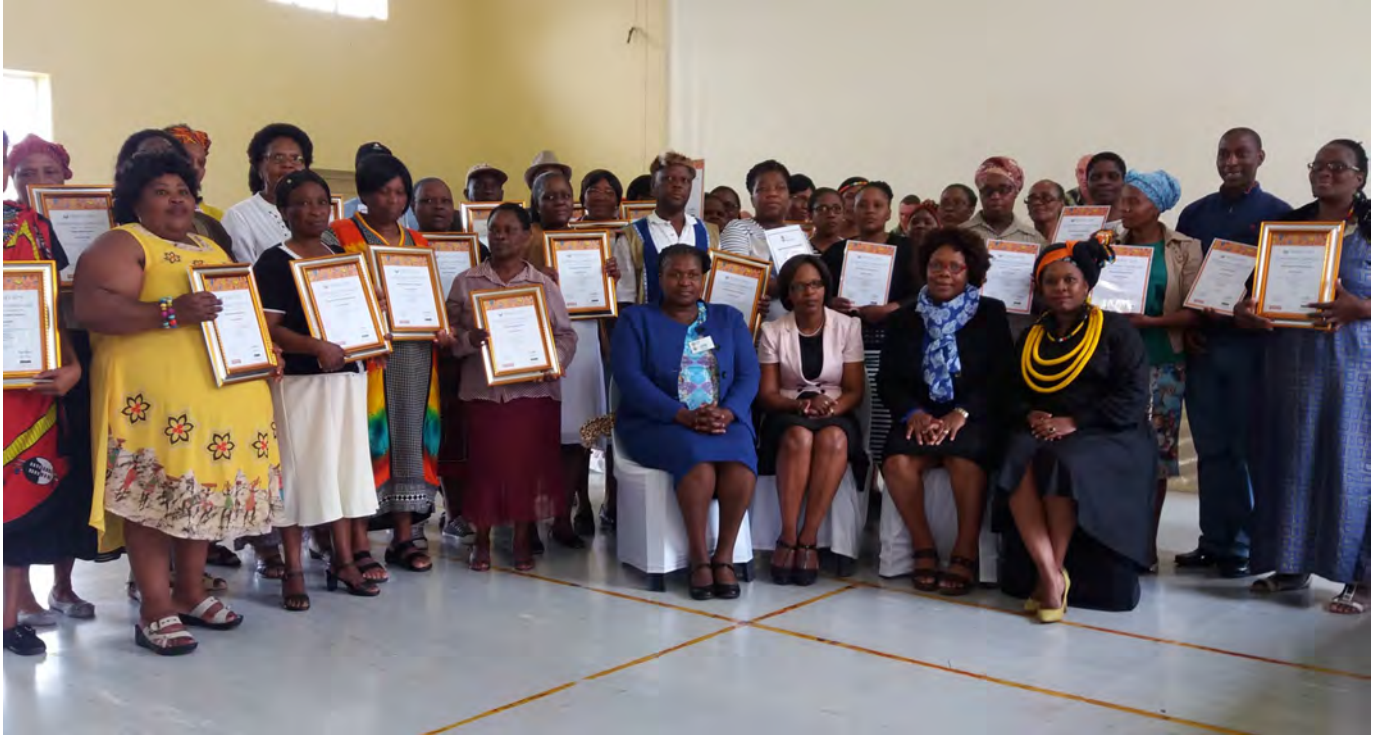
Excited and proud of their accomplishments, AET Students proudly display their certificates.

Excitement was in the air when Adult Education and Training (AET) Learners from Umgungundlovu Health District were awarded their qualifications and certificates which they acquired via the AET programme. AET caters for formal education for adults who did not complete mainstream education.