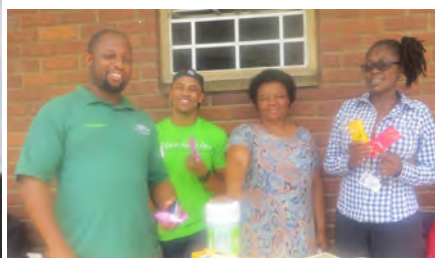
STI/CONDOM/PREGNANCY AWARENESS .... READ MORE ON PAGE 07