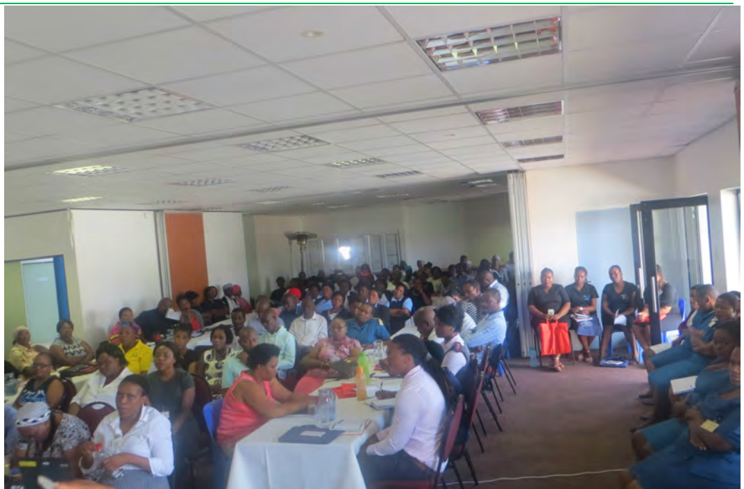
Above: Attendants at the National Health Insurance workshop listening to presentations from uMgungundlovu Health District. Impendle Local Municipality was one of the six municipalities under uMgungundlovu District who received workshops on the National Health Insurance. The workshops which began in December 2016 and finished in March 2017 were targeted to the leadership of municipalities and various stakeholders. Page 2 & 3

National Health Insurance workshops for municipalities were recently held. At the workshops information on how each municipality was doing on vital health measures or indicators was shared, in turn the attendants which included the top political leadership of each municipality came up with strategies on how health indicators of their communities can be improved and sustained.