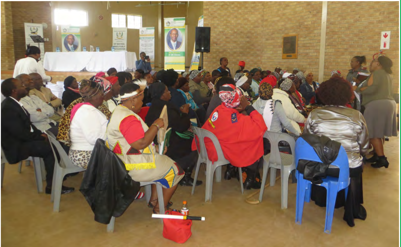
A group of Traditional Health Practitioners from the Impendle Sub-district formed part of 4 discussion groups which tackled the subject of healthy pregnancies