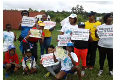
TB AWARENESS CAMPAIGNS ...READ MORE ON PAGE 05 & 06