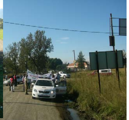
SAPS and Traffic Officers were also part of the healthy walk as they escorted us through the walk.