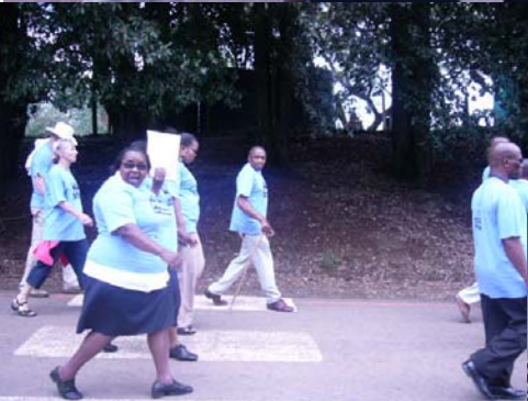
Above: Umzimkhulu staff joined the district health walk in Ixopo.