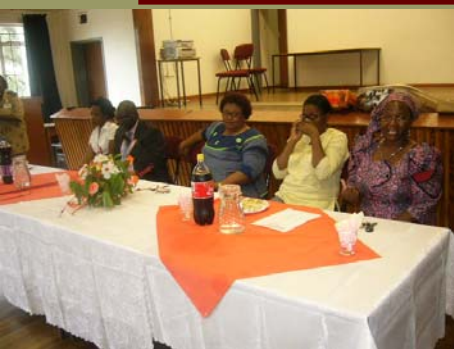
Guests at the main table (from left)