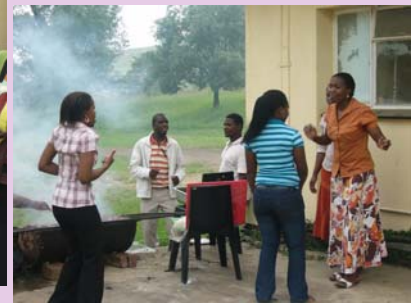
The excitement kept everybody moving.