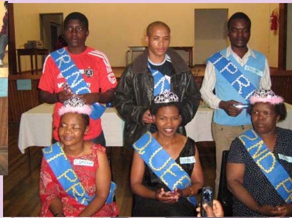
Middle Pictures: Excited Winners posing for photos

As part of psycho-social rehabilitation, the institution hosted Mr & Miss Umzimkhulu 2009 on the 10th June 2009 at Umzimkhulu Recreation Hall.