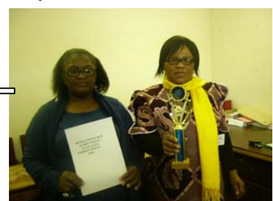
HUMAN RESOURCE DEPARTMENT PEER REVIEWS TROPHY THANK YOU VERY MUCH