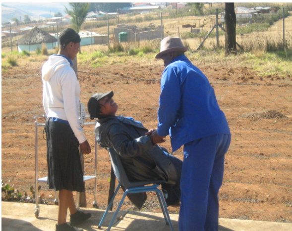
ABOVE: The locals also performed a drama play which was also very entertaining.