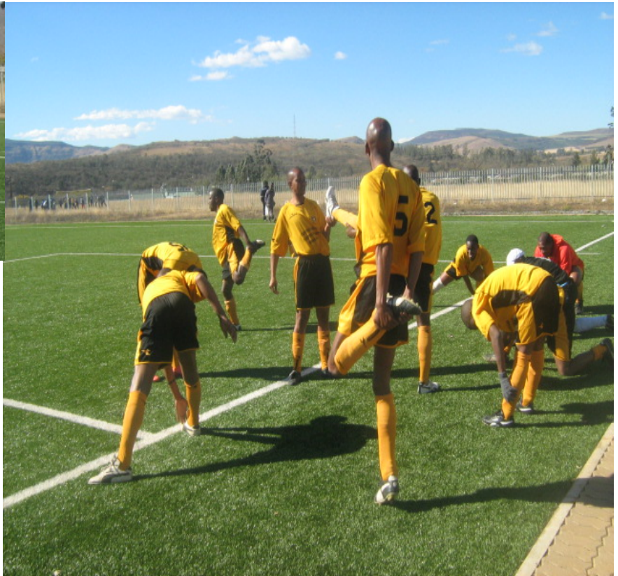
ABOVE: Our soccer team had a promising start to a soccer game which took place at the Umzimkulu college sports ground, on Wednesday (the 01/08/2012) only to suffer defeat on penalties! Hard luck majita!!!!