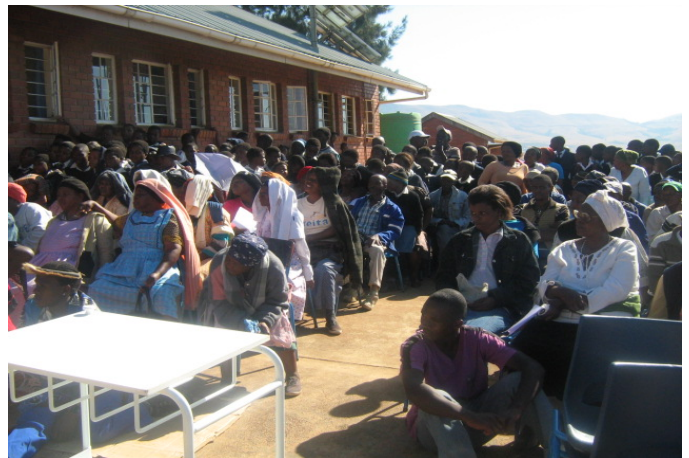
ABOVE: The people really did attend the event which shows that interest is increasing.