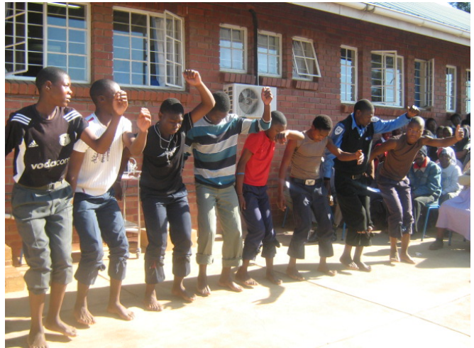
LEFT& RIGHT: The local young stars and old ladies come together in efforts of entertaining the crowd which came out in huge numbers. They performed traditional dances and scathamiya (cothoza mfana!!)