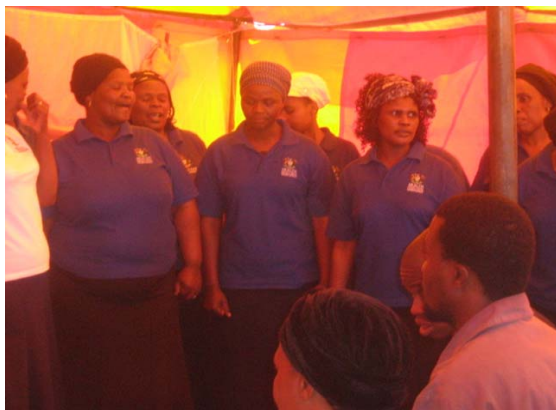
Above: The Community Care Givers sang a few songs from their local choir.