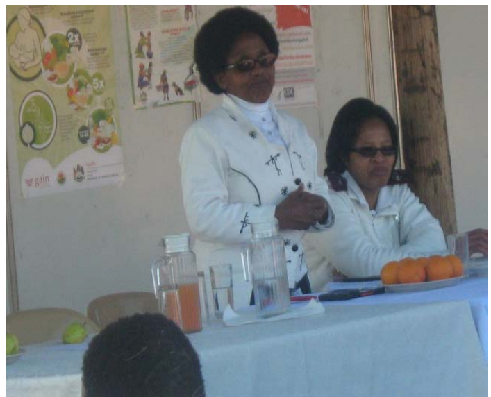
Top left: Its time for lunch at St Margerets gateway clinic. Bottom left: Staff choir performing on stage Top right: LSA supervisor delivering her speech.