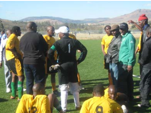
A small briefing just before the penalty shoot out.