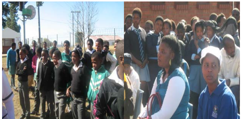
Above: Schools had to close down for the day so scholars and their teachers could join us in learning about mental health awareness.