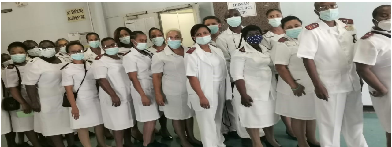
ADDINGTON HOSPITAL NURSES AFTER RECITING THE NURSES PLEDGE