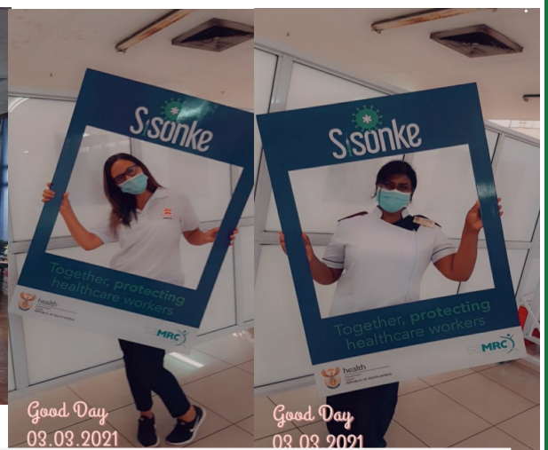
ADDINGTON EMPLOYEES VACCINATED AT PMMH