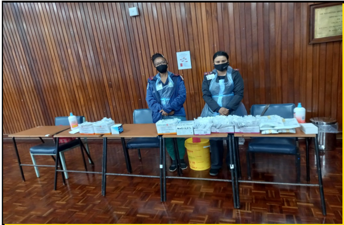
SR MOODLEY AND SR SHABALALA AT VACCINATION SITE