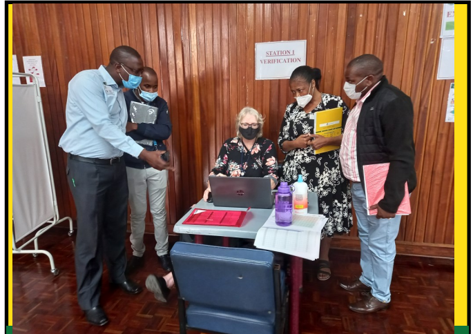
District support visit