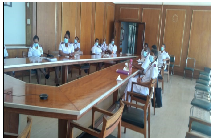
ONLINE NURSES DAY CELEBRATION EVENT