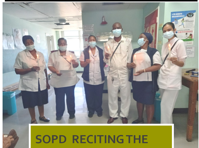
SOPD RECITING THE NURSES PLEDGE