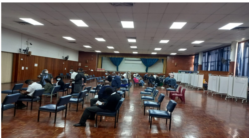
POST VERIFICATION STATION AT ADDINGTON HOSPITAL