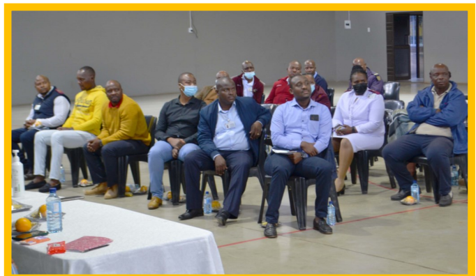
Above Photo: KwaMagwaza Hospital management team and King Cetshwayo District Management team attending a prayer day organised by District Director.