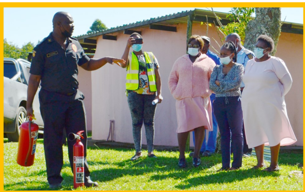
Above Photo: Mthonjaneni Fire Fighter educating KwaMagwaza Hospital Staff on how to handle fire extinguishers during fire outbreak.