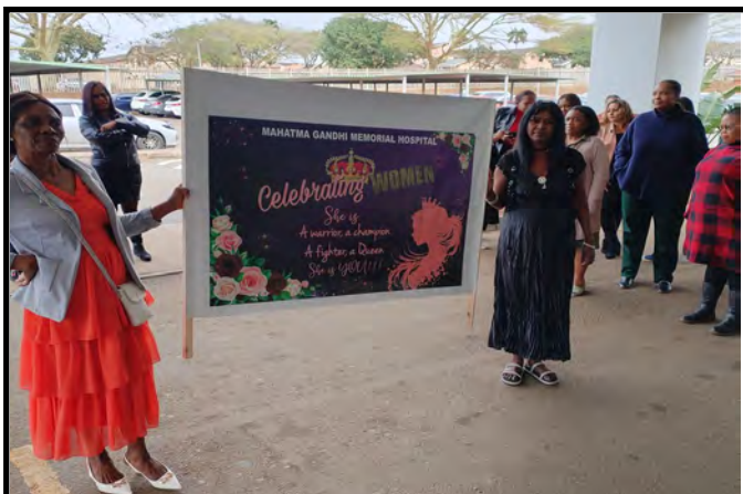
MGMH hospital women matching during the women's day