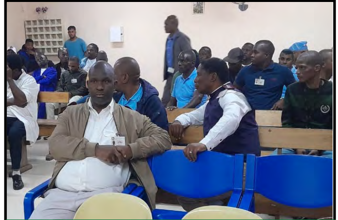
Above Nurse Manager was part of the Men's forum. Below: two of our players showing trophy they won during the District tournament.