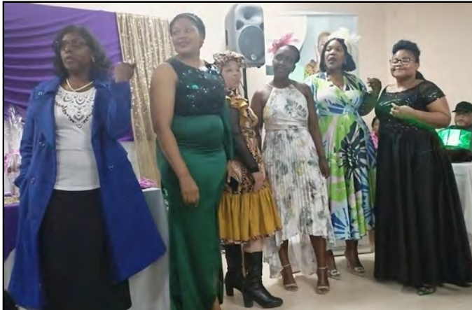
Staff members who participated in modelling.