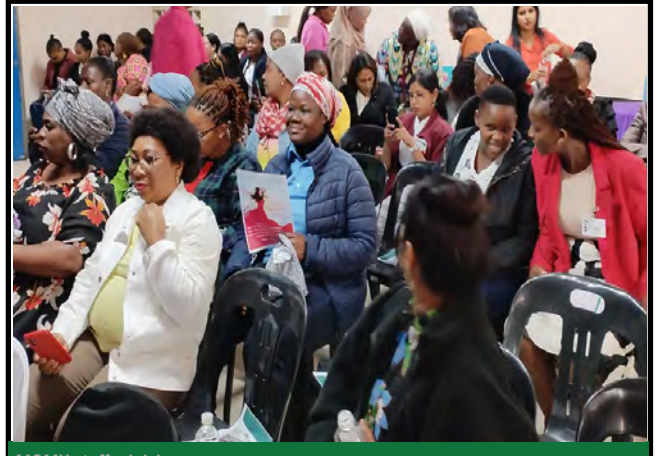
MGMH staff rejoicing.