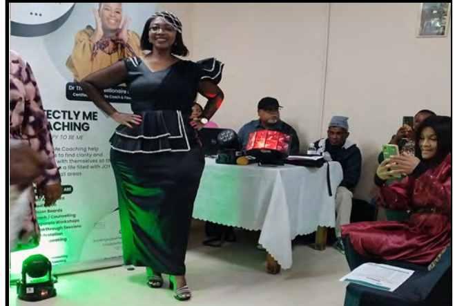
Mrs T Mdlatshe expressed herself in modelling completion.