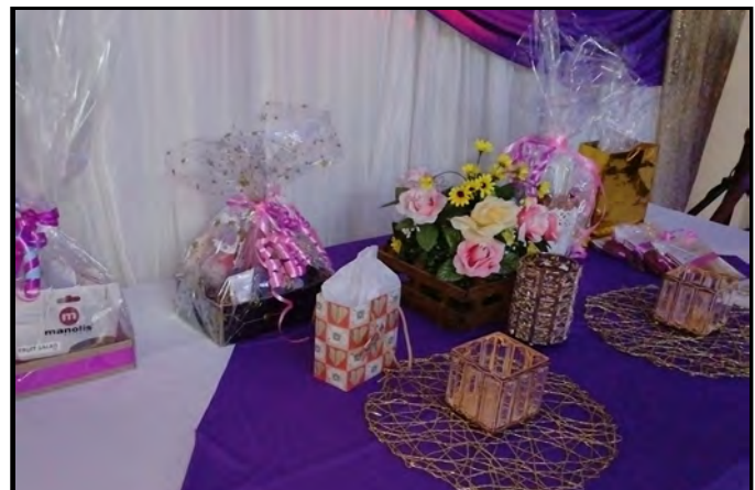
These are some of the gifts that were available on the day.