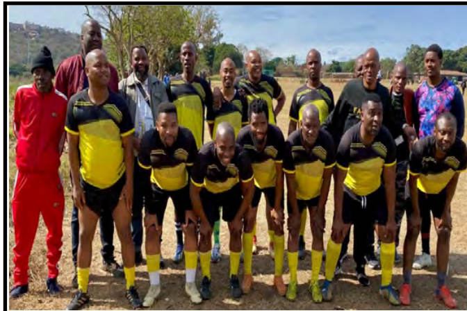
MGMH SOCCER TEAM: These gentlemen did exceptionally well in the tournament. They got position 3 and they brought back a trophy to the CEO, well done guys