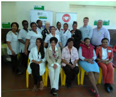
OUTREACH CAMPAIGN... READ MORE ON PAGE 3

FIGHTING DISEASE, FIGHTING POVERTY, GIVING HOPE