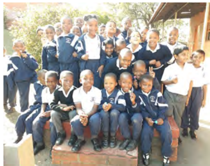
COMMEMORATION OF MANDELA DAY READ MORE ON PAGE 4