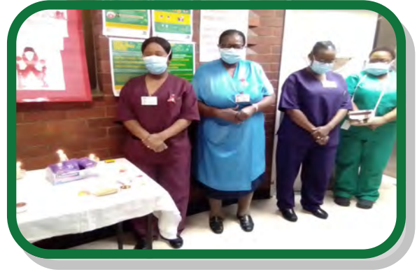
HD department holding Prayer Service on World Aids Day