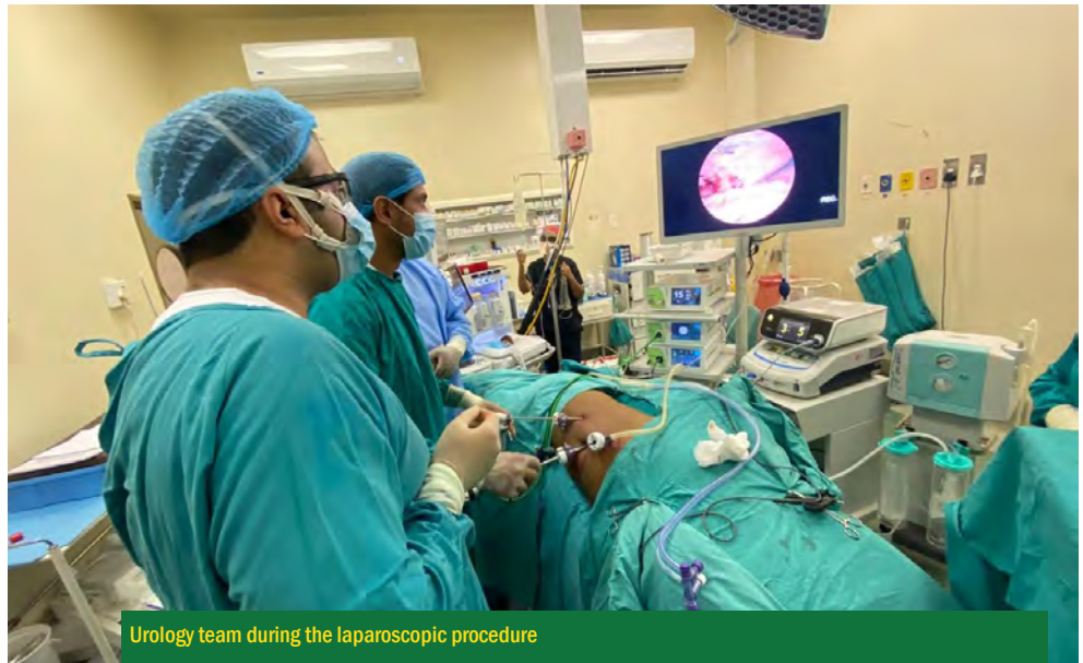
Urology team during the laparoscopic procedure

From the beginning of the year, the team at St. Aidans has employed laparoscopy in other urological procedures, and plans to offer further procedures to its armamentarium in the future.