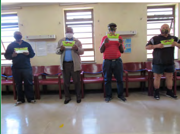
Urology patients receiving their hampers.

November is also regarded as Men's Health Awareness month, all prostate cancer patients were gifted with the hamper that was sponsored by AstraZeneca.