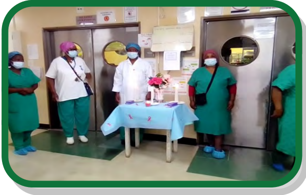
Theatre department holding Prayer Service on World Aids Day