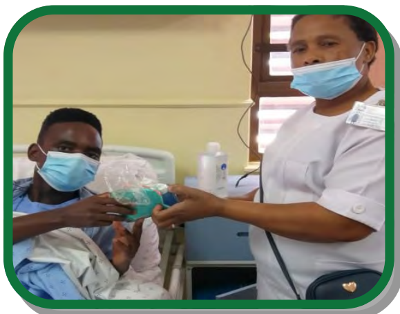
EN Sithole handing over the gift hamper to the patient