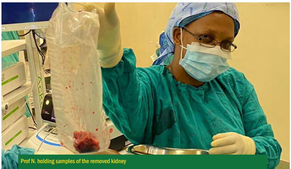
Prof N. holding samples of the removed kidney