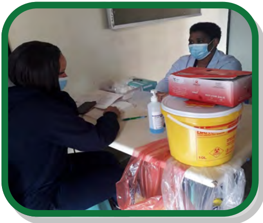
HIV Testing and counselling