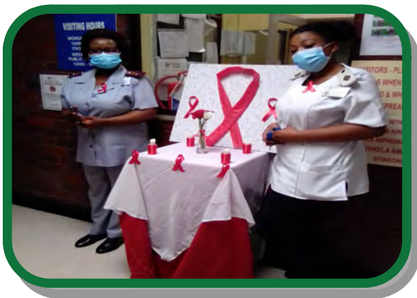
Urology Ward holding Prayer Service on World Aids Day