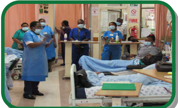
Prof N. Ziqubu facilitating the educational programme on Customer Impact