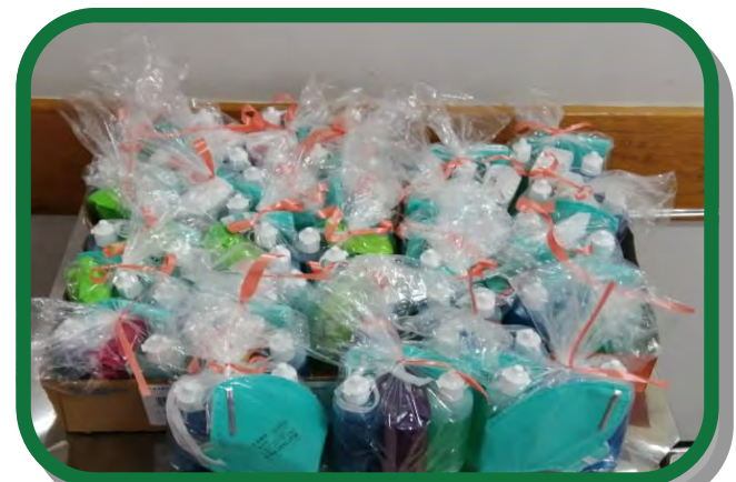
Little gift hampers prepared by Urology Ward.