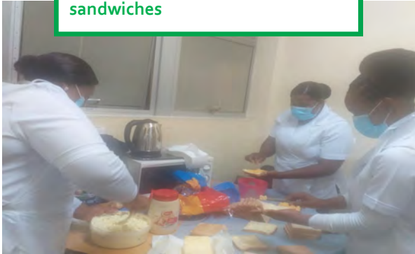
Urology Team preparing sandwiches