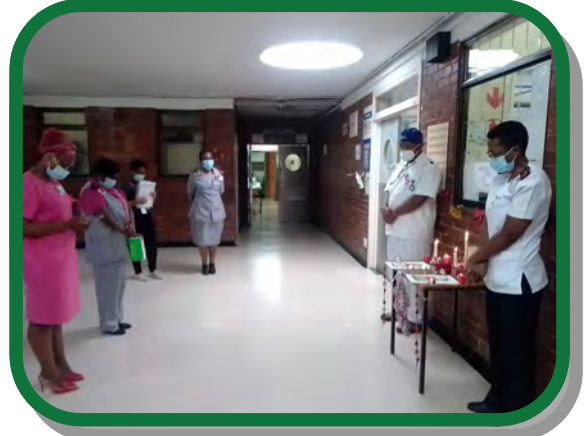
High Care and Nursing Management holding Prayer Service on World Aids Day