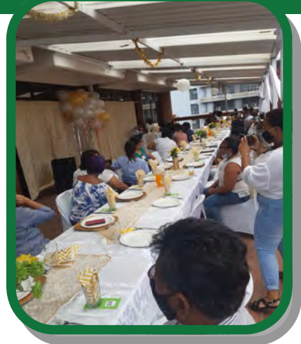
Attendees for the year end function