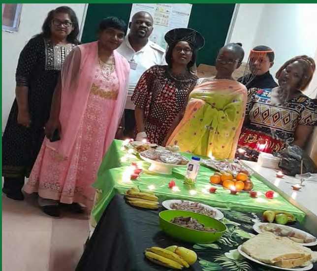
Fun filled day for Urology Ward staff members as they posed for the camera in their Traditional Attires