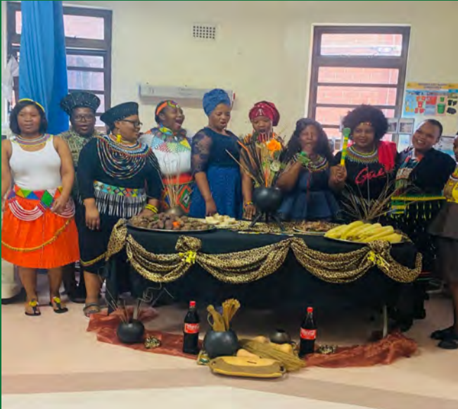
Hemodialysis Team singing one of the AmaZulu traditional song