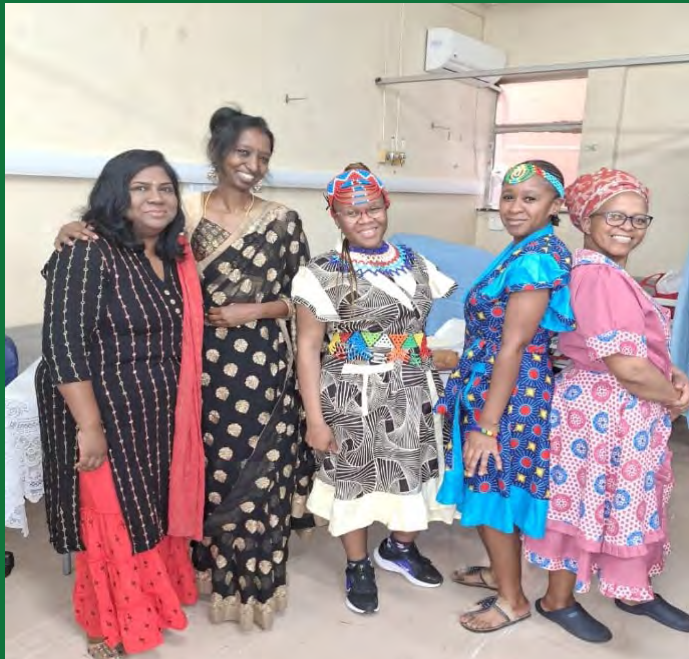
High Care Team comfortably dressed in their traditional outfits.