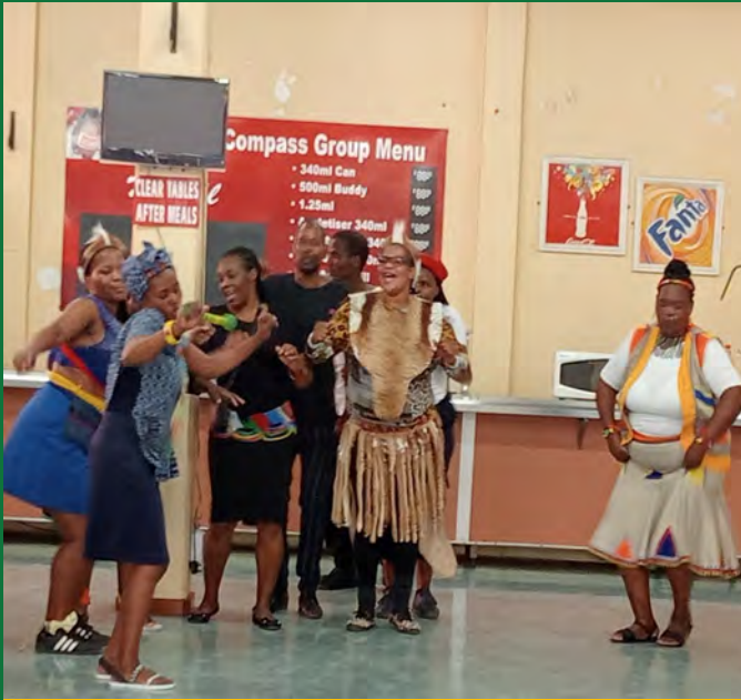
Tsebo Cleaning Team performing a traditional dance