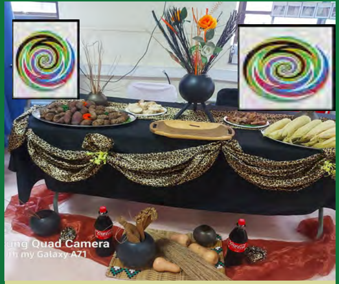
ung Quad Camera with my Galaxy A71