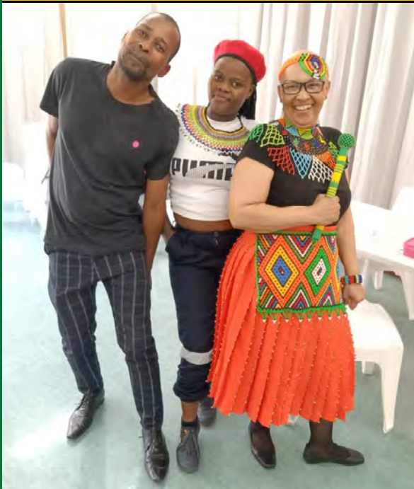
Cleaning Supervisor and Staff Members celebrating their heritage