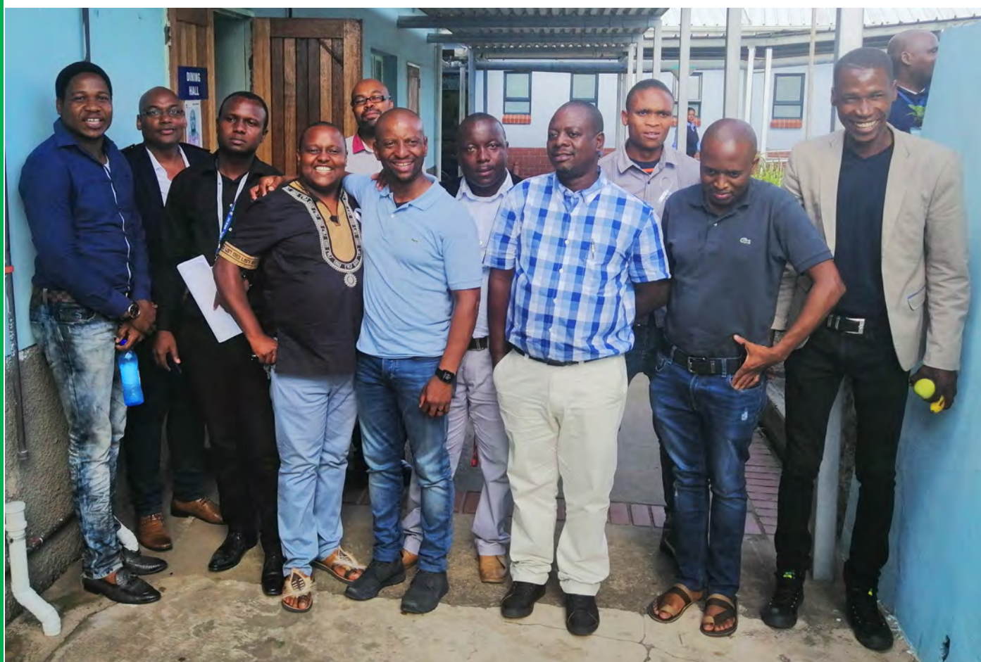
Operation Sukuma Sakhe Task Team that planned the launch with Prince Nhlanganiso Zulu after the programme at Mseleni Hospital

The prince urged men to play an active role in their respective communities when it comes to addressing social ills such as substance and drug abuse, teenage pregnancy, crime, and rape. Isibaya samaDoda is expected to conduct dialogues going forward and on issues of concern in order to influence behavioural change among men.