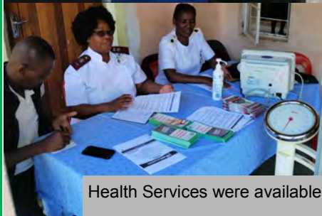
Health Services were available for men