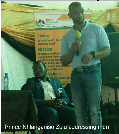
Prince Nhlanganiso Zulu addressing men