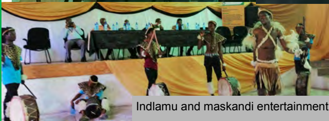
Indlamu and maskandi entertainment