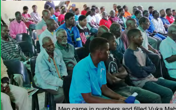
Men came in numbers and filled Vuka Mabasa Hall