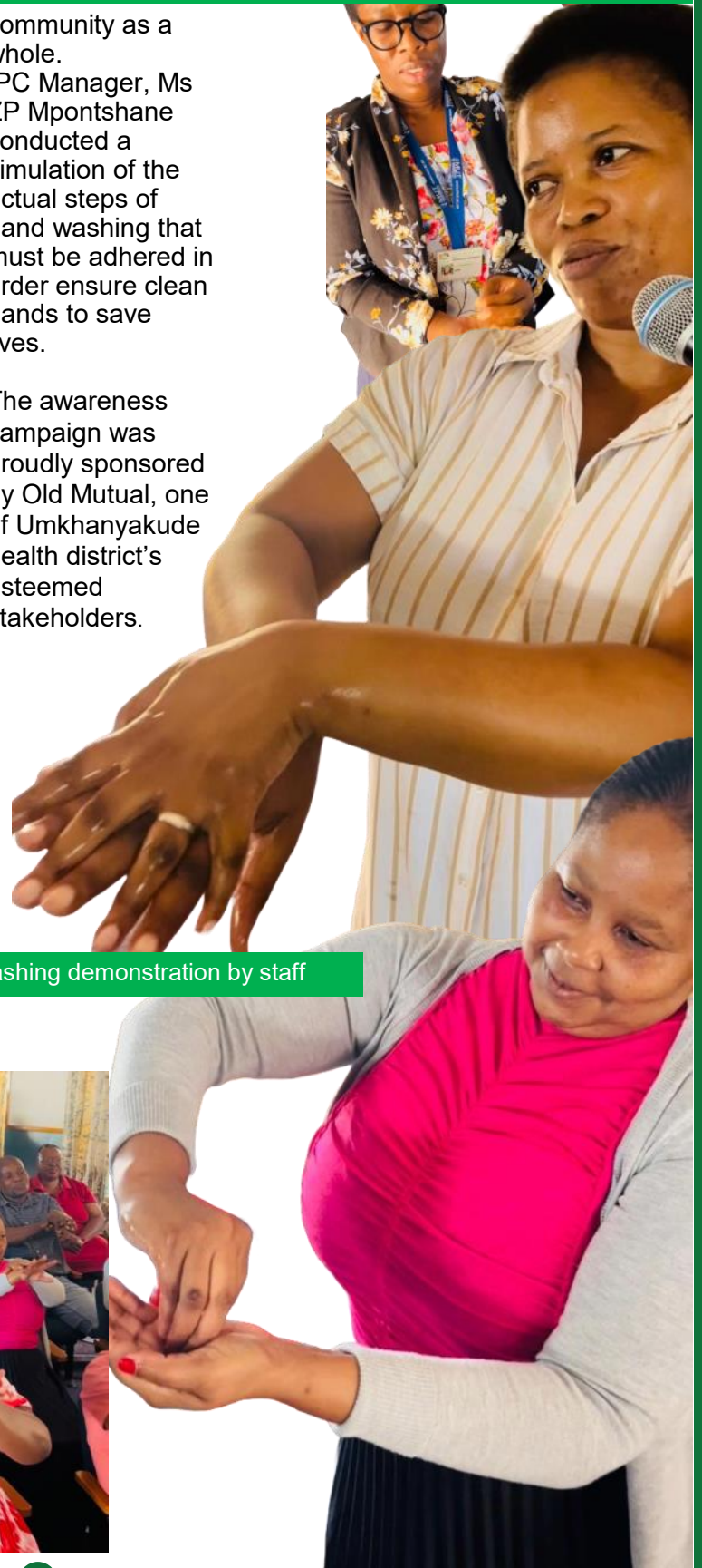
Hand washing demonstration by staff

The awareness campaign was proudly sponsored by Old Mutual, one of Umkhanyakude health district’s esteemed stakeholders.