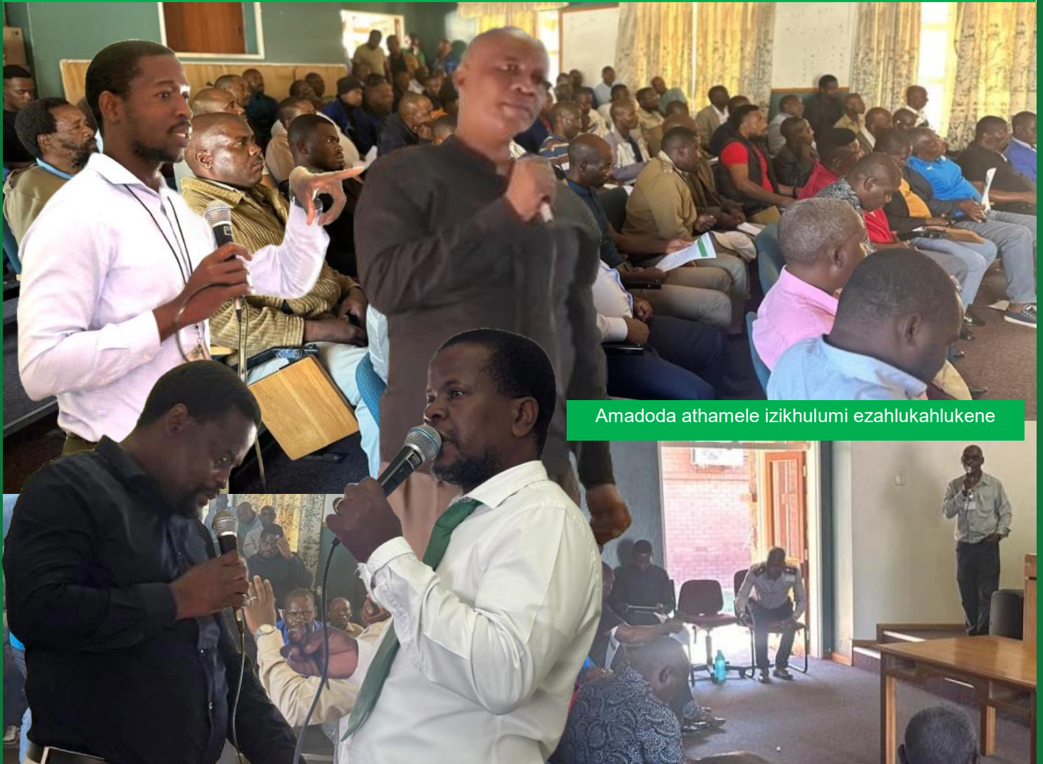
Amadoda athamele izikhulumi ezahluahlukene

P hela amadoda kuyadingeka ukuba ake ahlangani nje adingide izindaba eziwathintayo. Ikakhulukazi ngoba phela eMkhanyakude Health District kunekomidi lamadoda okuyilona elisekhaleni ukuqinisekisa ukuthi konke okuqondene namadoda kuyenzeka.