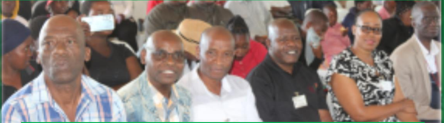
Some of Umkhanyakude hospitals CEOs and members of district management team