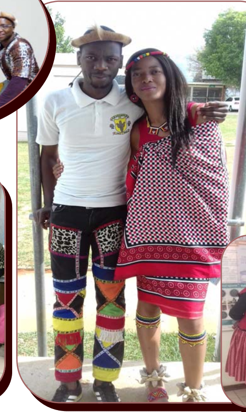
Niemeyer Hospital employees