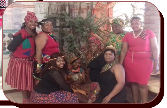
Groenvlei Clinic employees