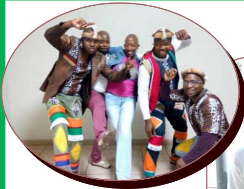
District Office employees