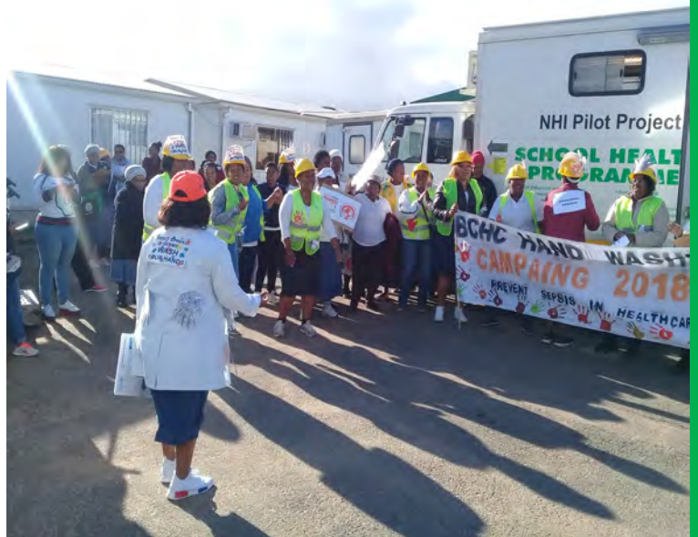
HAND WASHING CAMPAIGN BRUNTVILLE CHC 2018

The main purpose was to spread the gospel of hand washing to all clinical and non-clinical staff and outside to the community since we are a primary level health care provider.