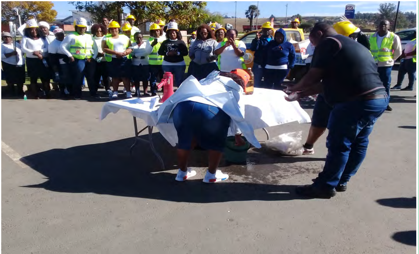
HAND WASHING DEMONSTRATIO BY KFC SUPERVISOR