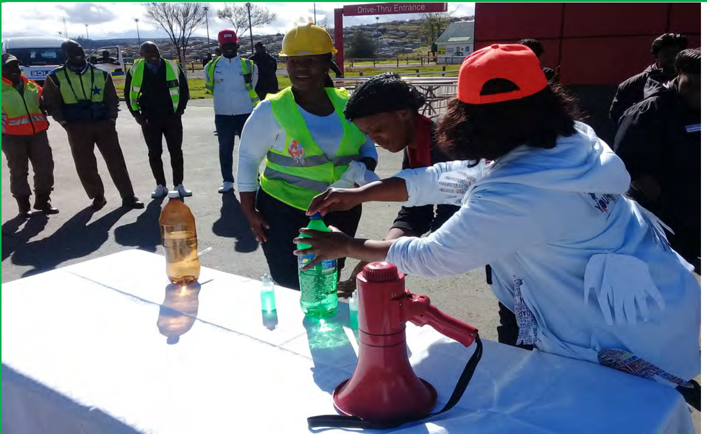
HAND WASHING AT KFC CONTINUES WHILE THE TRAFFIC OFFICERS AND THE DIS- ASTER MANAGEMENT COMMITTEE OBSERVING