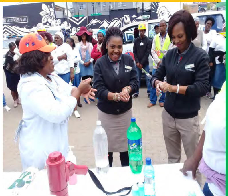
Far right Pick n Pay staff washing their hands