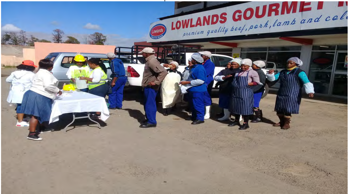
Lowlands staff awaiting for hand wash Demonstration