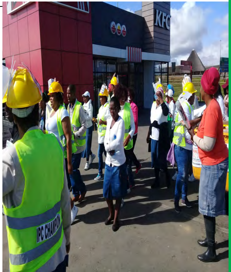
FAR RIGHT THE CAMPAIGN MARCH LEAVING THE KFC NOW TO LOWLANDS BUTCHERY IN TOWN