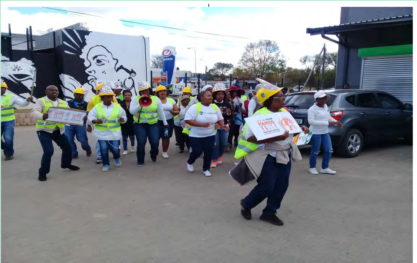
ENTRANCE TO MOOIRIVER MALL (PICK N PAY) OCCUPATIONAL NURSE LEADING THE MARCH