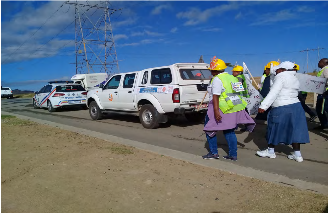
March was led by the facility Management including the CEO, Traffic department, SAPS and Departmental vehicles , Below transport officer holding the banner