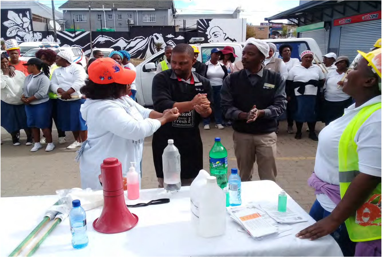
Pick n Pay kitchen staff washing their hands using a Tippy Tap