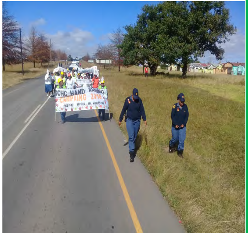
MARCH PROCEEDINGS TO TOWN ACCOMPANIED BY THE SAPS TO ENSURE STAFF SAFETY