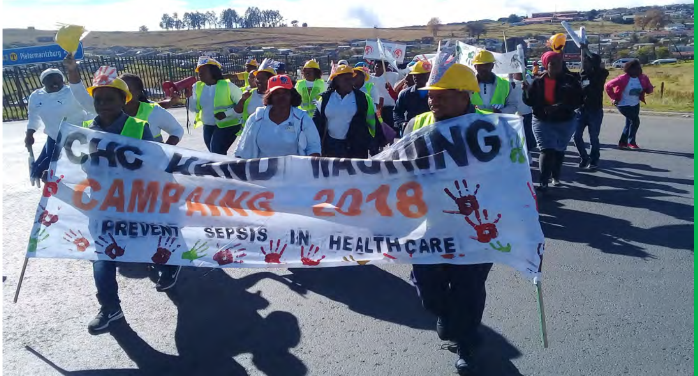
March proceedings half way to MOOPLAZA TOLL GATE