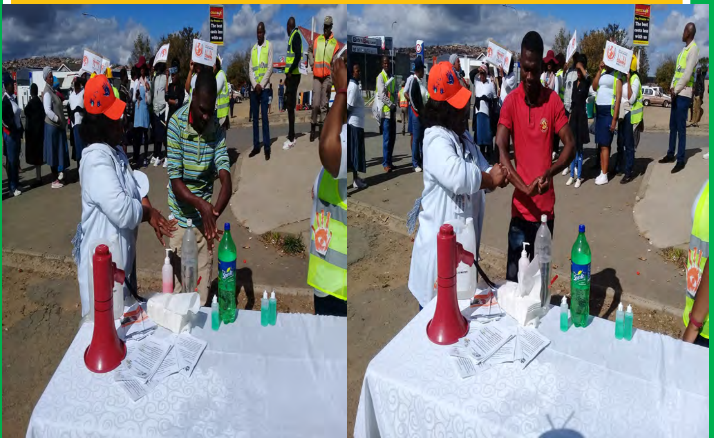
Mammass chicken staff washing their hands following the correct steps of washing