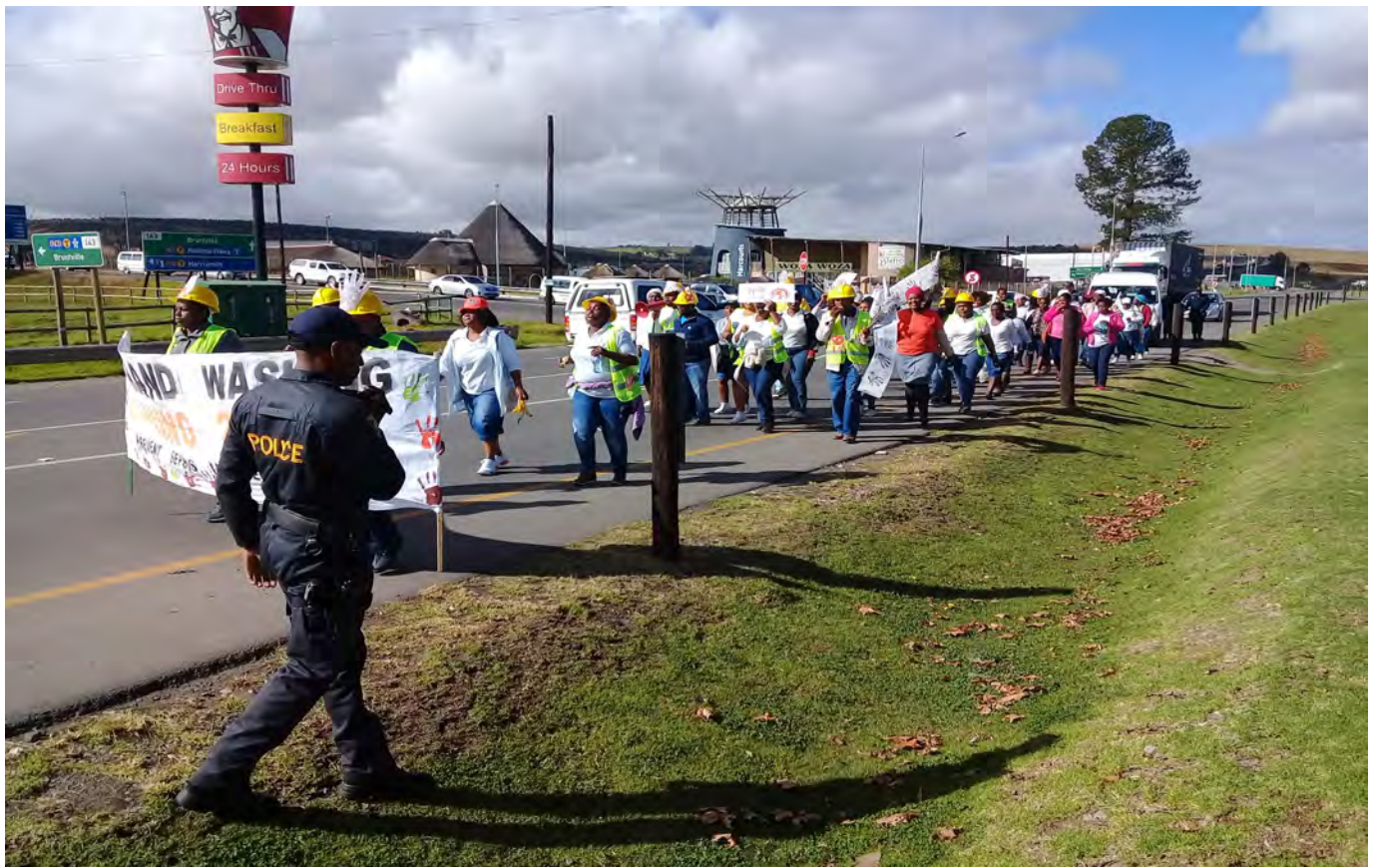
MARCH PROCEEDINGS TO MOOIRIVER KFC WITH THE SUPPORT OF SAPS