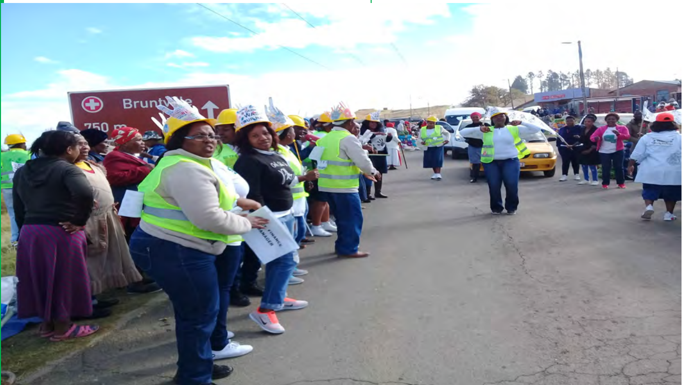
Ndawonde (General orderly community ws waiting for their so-