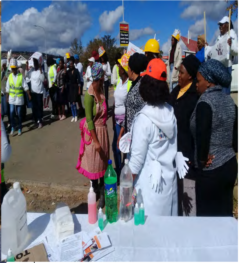
Hand washing by one of the ladies selling food in town