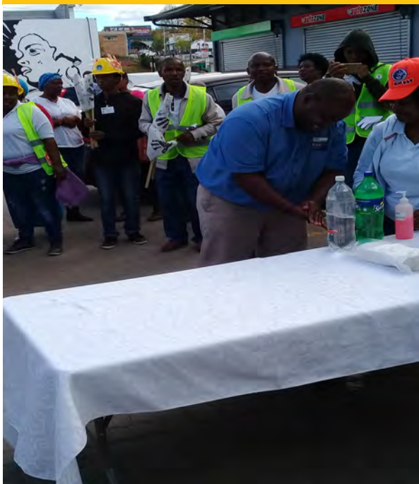
Above Pick n Pay supervisor washing his hands