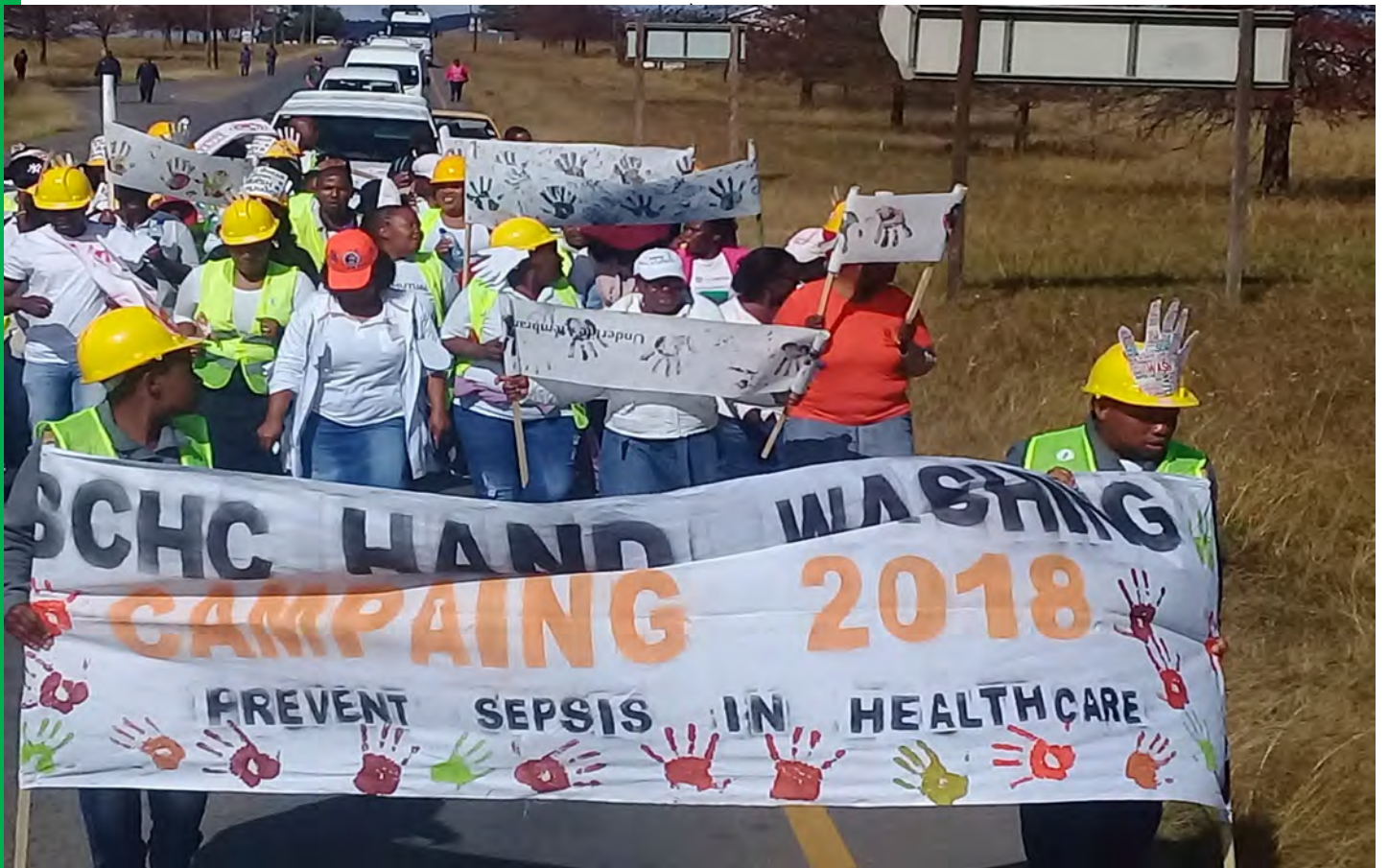
Hand washing slogans by the CEO, in the middle of the staff