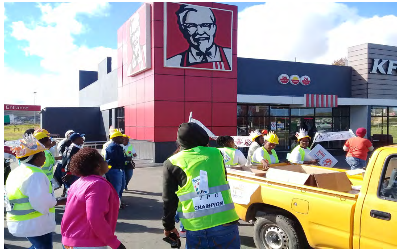
BCHC STAFF AWAITING FOR KFC STAFF TO JOIN THE HAND WASHING