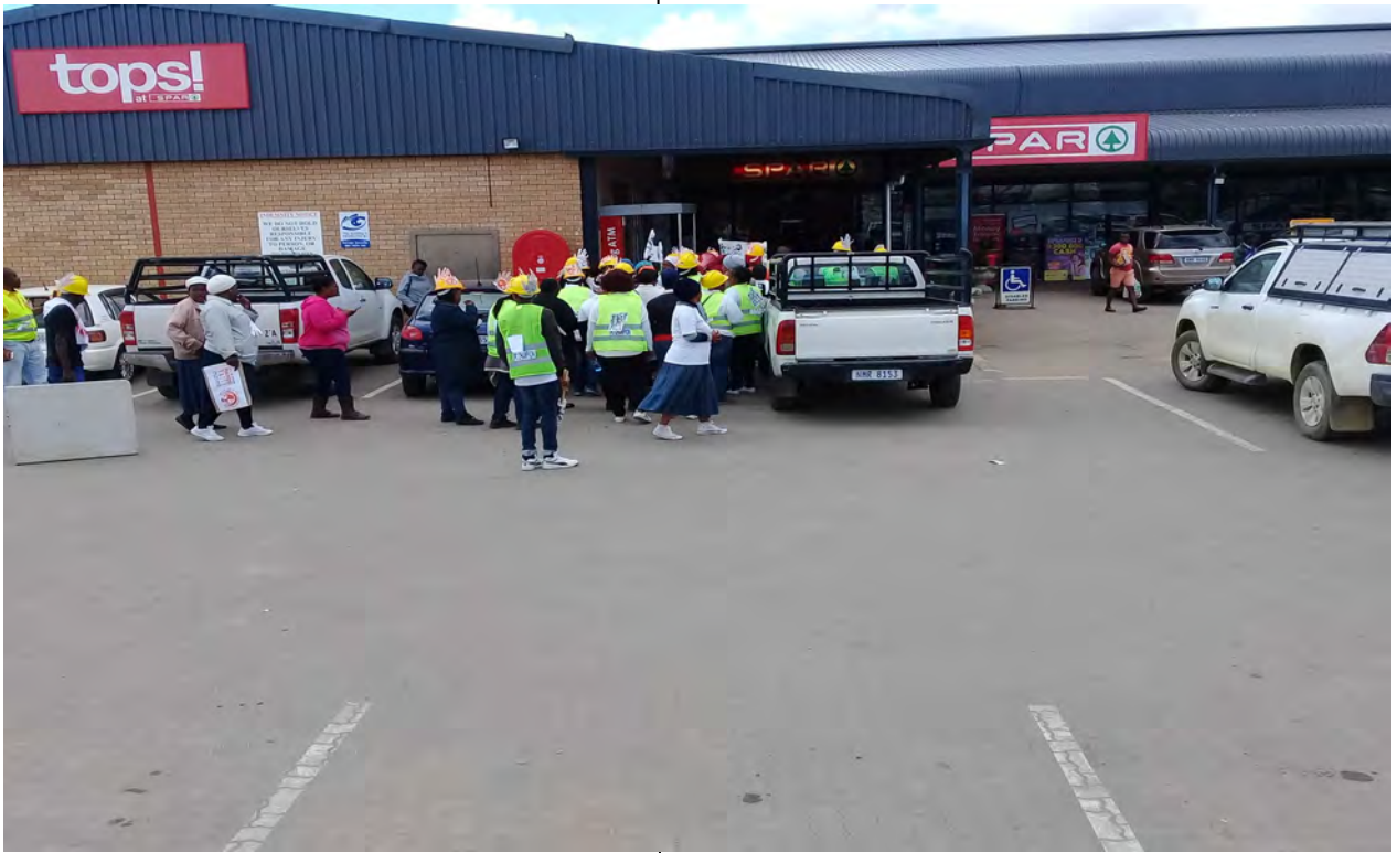
ABOVE: ENTRANCE TO MOOIRIVER SPAR, BELOW SPAR EMPLOYEE WASHING HER HANDS