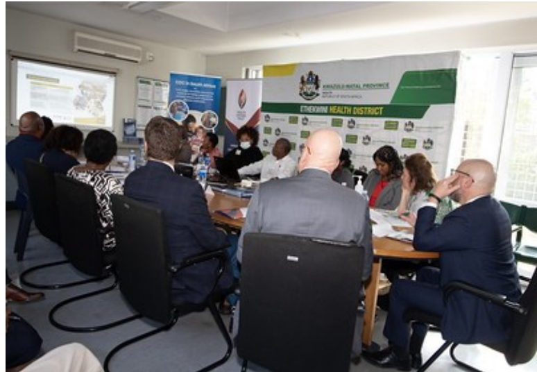
US Delegate with the facility Management at the boardroom

As the team departed, the AYFS group accompanied them with music. A group photo was taken at the Pele Box before the delegation left for their vehicles. Towards the end of the tour, the Charge d' Affaires specifically praised the facility's impressive patient flow despite the large number of patients seen. The Cato Manor CHC management expressed their gratitude for the opportunity to host such esteemed guests.