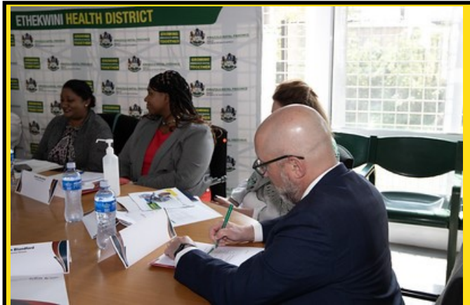
Us Delegates at the boardroom