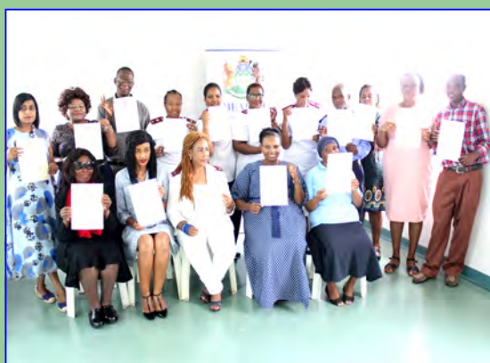
Employees with 20 years service

The event was completed by a sterling performance by a hospital gospel group called Bees of Heaven who made sure that the recipients of the awards never forget their special day.