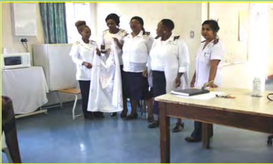
Ward O2 and KMC preparing to showcase their item