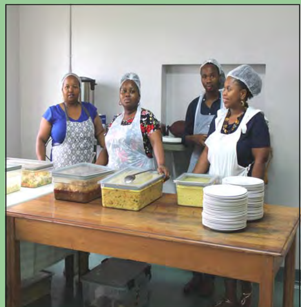
HR Staff waiting to serve employees at the long service award ceremony