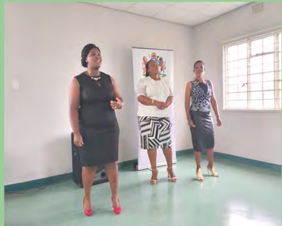
Bees of heaven performing at the Long Service award ceremony