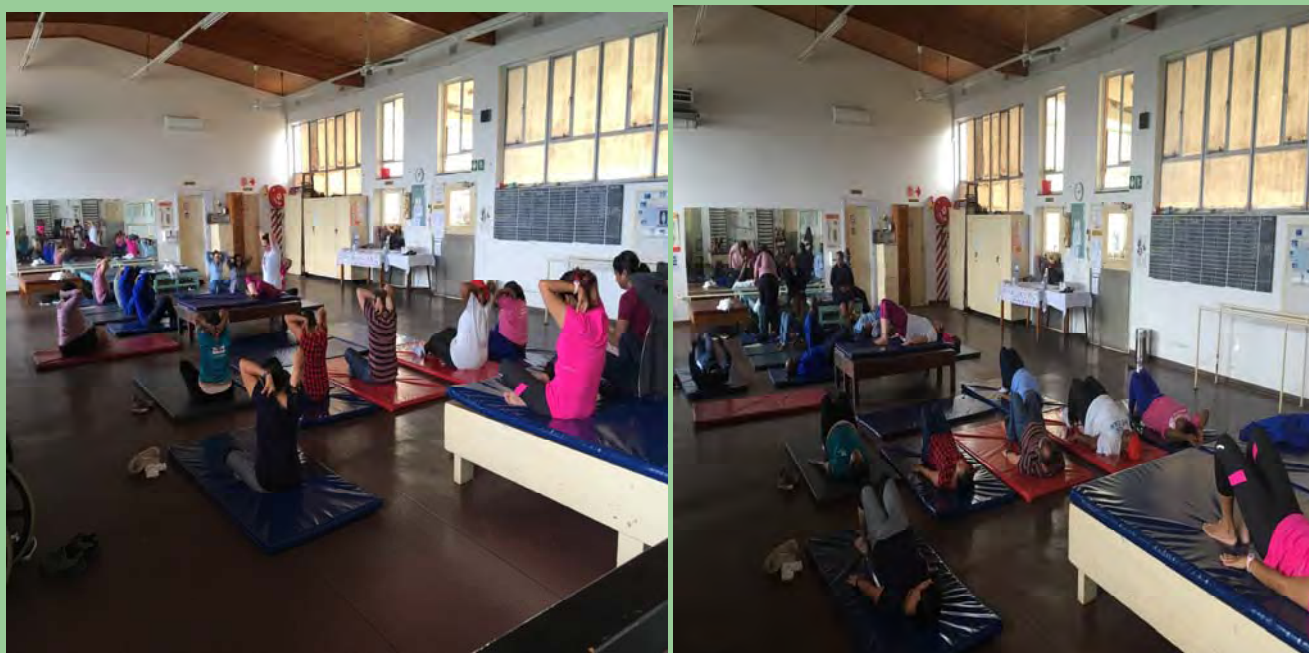
Staff taking part in various techniques of back and neck exercises

Physiotherapy back week takes place each year in September. This year the physiotherapists ran 2 yoga classes for neck and back stretching and strengthening. These classes were held on the 17 th & 19 th September 2019 and were well supported by PPSD & Clairwood staff. The class started with a relaxing neck program that lasted 15 minutes and ended with a lower back program that lasted 20 minutes. Everyone really enjoyed the neck program and felt that it really relieved the tension in their neck, shoulders and upper back. The lower back program was a bit more strenuous and there was quite a lot of groaning heard during the session. Everyone who attended agreed that they felt extremely good after the session and were motivated to keep it up at home. All who participated received a skipping rope or a pen after the session.