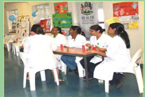
Physiotherapy department performing an

The global hand washing day is dedicated to increasing the awareness and understanding about the importance of hand washing.