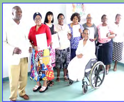
30 years service