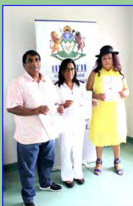
40 years service