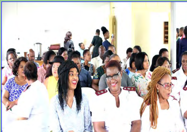
Award recipients enjoying speeches on their special day