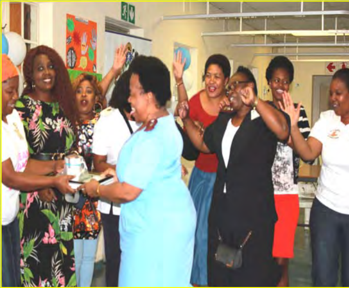
Thusong clinic receiving the award for position one