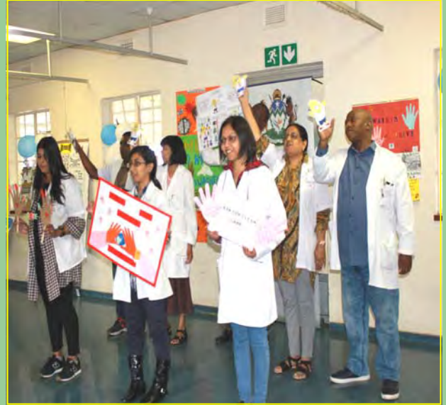
Pharmacy dept. performing their hand washing activity