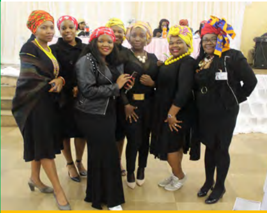
Hlengisizwe CHC Staff commemorating Women's Month