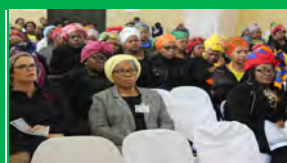
Women's Day Gallery READ MORE ON PAGE 3