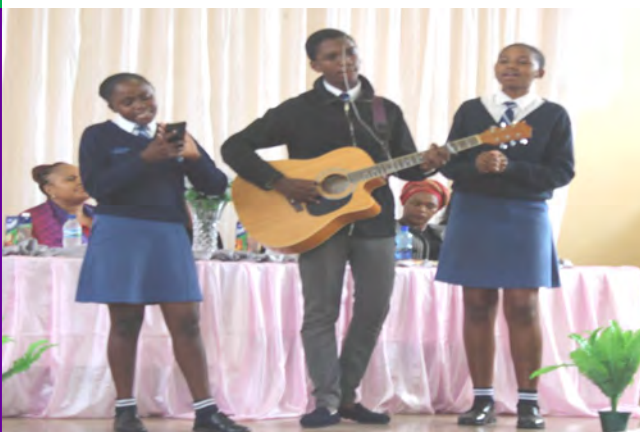
Sikhethuxolo High School Students entertaining the Guests