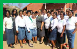
Mental Health Awareness READ MORE ON PAGE 4