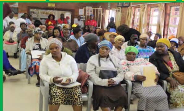
Ntshongweni community listening attentively to speeches