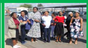
FAREWELL PARTY ..... READ MORE ON PAGE 7