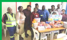
Mandela Day READ MORE ON PAGE 2