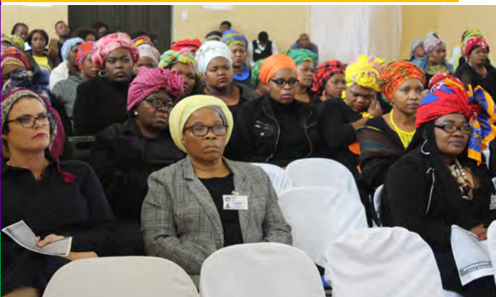
Hlengisizwe CHC staff listening attentively to Motivational Speakers